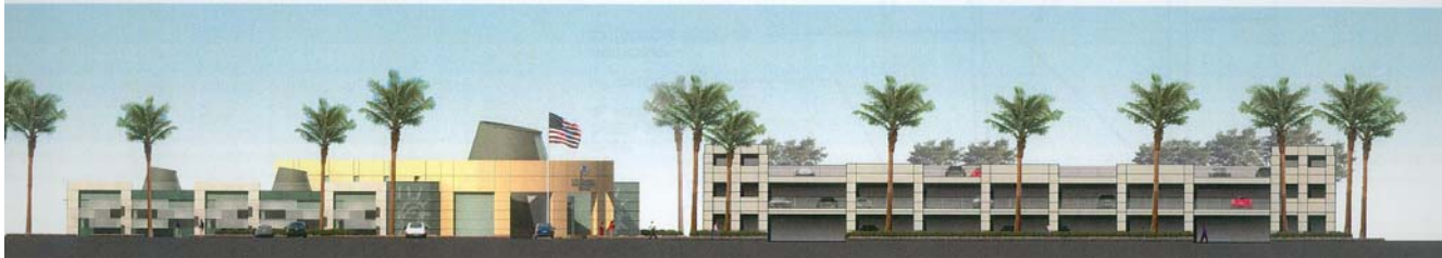
Exterior Elevation of Broward County Field Office

U.S. Citizenship and Immigration Services