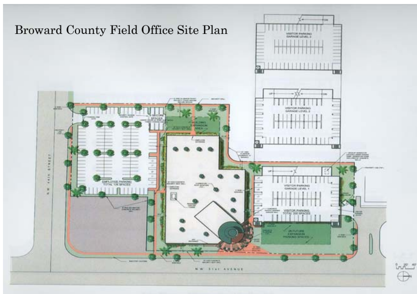
Broward County Field Office Site Plan