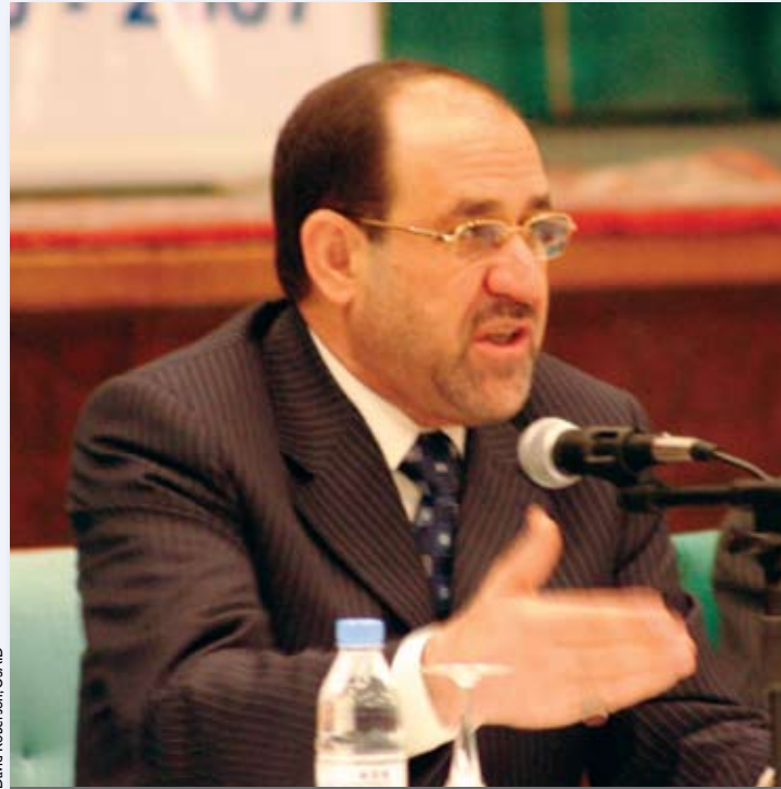
Iraqi Prime Minister Nouri al-Maliki speaks at Iraq's first nationwide provincial development strategy conference on March 2.

BAGHDAD, Iraq —Representatives from Iraq's 18 provinces gathered in Baghdad on March 5 for the country's first provincial development strategy convention aimed at helping each province coordinate with the national government on ways to spur development.