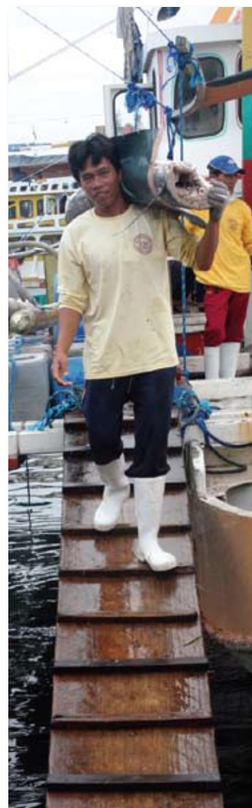
One of the fishermen from a “municipal fishing boat,” or small local fishing boat, is bringing in marlin to the dock. These fishermen “hand line” fish with no poles and use monofilament line to bring in these fish, some weighing as much as the fishermen themselves.

USAID's approach to designing programs geared towards the General Santos Region provides new perspective on the age old adage “give a man a fish and he'll eat for a day, but teach a man to fish and he'll eat for a lifetime.” For Mindanao, teaching a man to fish not only helps him feed himself and his family, but also helps expand zones of prosperity and peace. ★