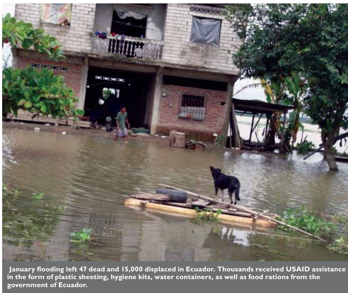
January flooding left 47 dead and 15,000 displaced in Ecuador. Thousands received USAID assistance in the form of plastic sheeting, hygiene kits, water containers, as well as food rations from the government of Ecuador.