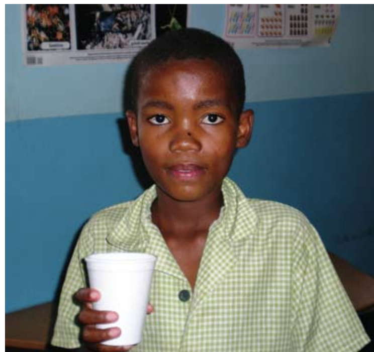
While attending an HIV/AIDS prevention program, a young Namibian boy enjoys a cup of nutritious yogurt.