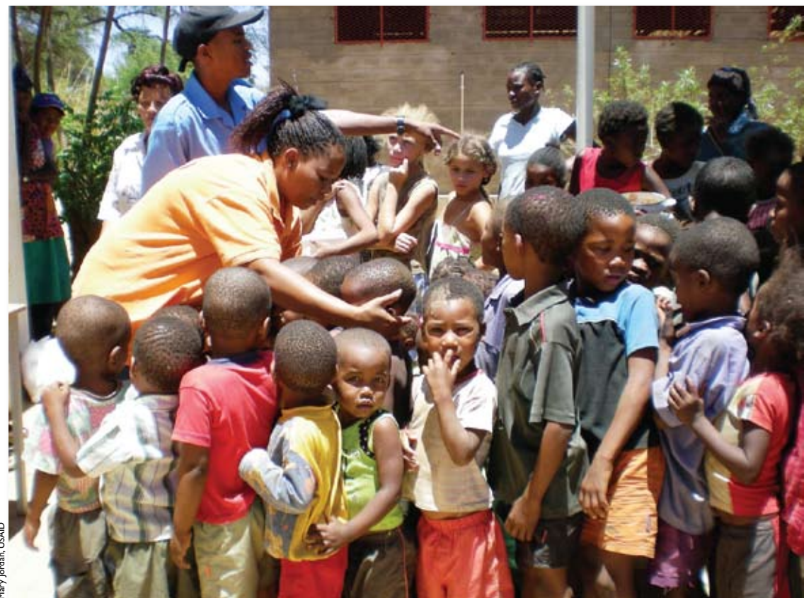
At an HIV prevention education site in Namibia, the number of children attending the program has doubled since the launch of the public-private partnership.

In its nearly 20-year history as an independent nation, Namibia has invested heavily in education and health, and has been committed to promoting the economic, social, and political empowerment of historically disadvantaged Namibians. Tackling the country's HIV/AIDS epidemic is no exception. USAID delivers HIV/AIDS programs and service to Namibians in partnership with the President's Emergency Plan for AIDS Relief. Namibia is one of the Emergency Plan's 15 focus countries, and in fiscal year 2007 received $91.2 million to support HIV/AIDS prevention, treatment, and care programs.