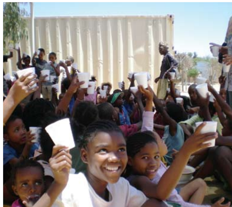
A public-private partnership launched by USAID is allowing these children in Namibia to receive a cup of nutritious yogurt, coupled with HIV/AIDS prevention education, every day.

Already the program is having an impact. At the outset, 400 children were being reached at two sites. As of March, just one month later, the number of children attending HIV/AIDS prevention programs had doubled. ★