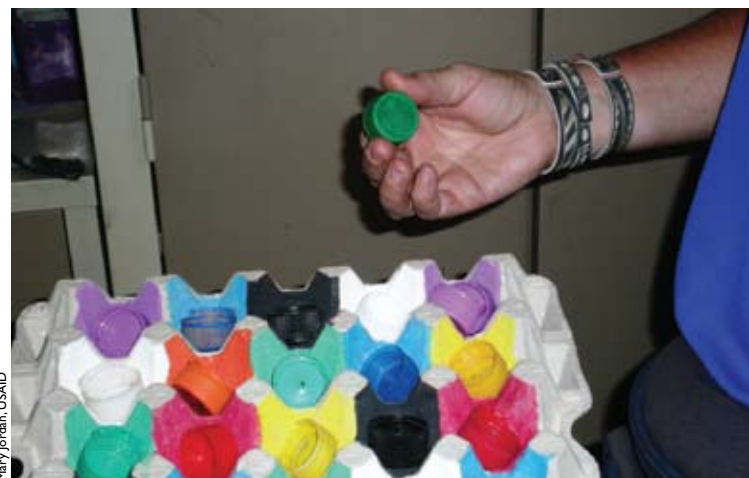
A homemade game of mixing and matching is one activity children enjoy at an HIV/AIDS prevention site in Namibia.