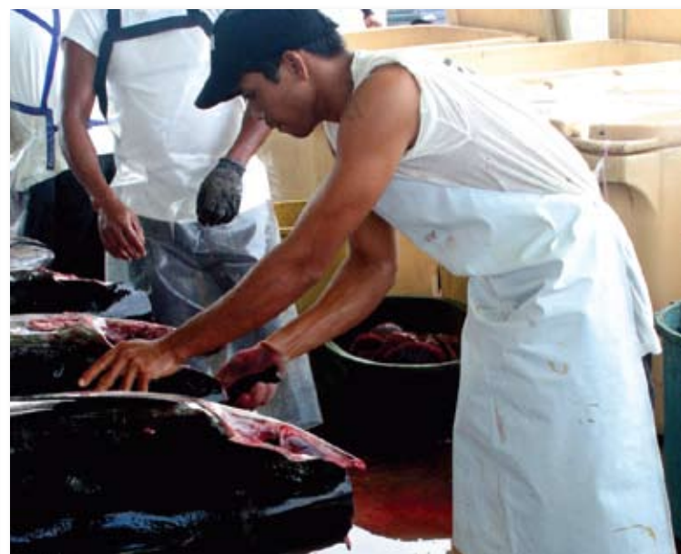
Once the catch is brought ashore, the market becomes very busy. Much of the seafood is sold directly to consumers in the local or “wet fish” market, and eaten right in Mindanao. The General Santos City Fish Port Complex, supported by USAID, helped increase the quality of the catch, especially in sanitation, and therefore, the marketability of the tuna. This facility notably improves the process of preparing fish over the days when fishermen just hauled their catch onto the beach and cleaned it right there.