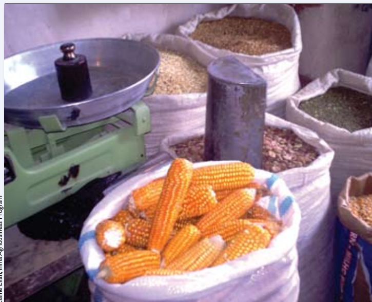
A maize production promotion supported by USAID in Al Anbar showed farmers that commercial maize growing is viable under local conditions and can become the cornerstone for locally produced poultry feed.

The program showed Al Anbar farmers that commercial maize production is viable under local conditions and can become the cornerstone for rural sustainability and for improved lives and livelihoods throughout the province. ★