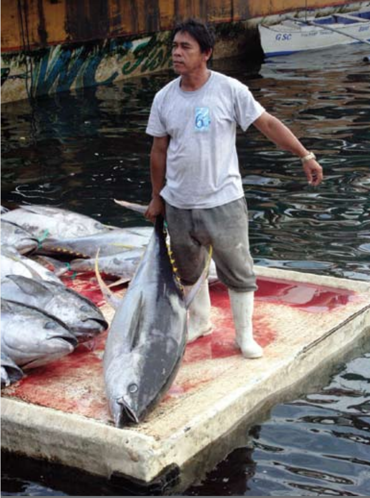
Yellow fin tuna is one of the more prevalent catches. The large tuna are inspected, graded, and, if they meet the standards, go into the international sashimi trade. The grade is determined by external appearance, flesh color, and texture of the meat.