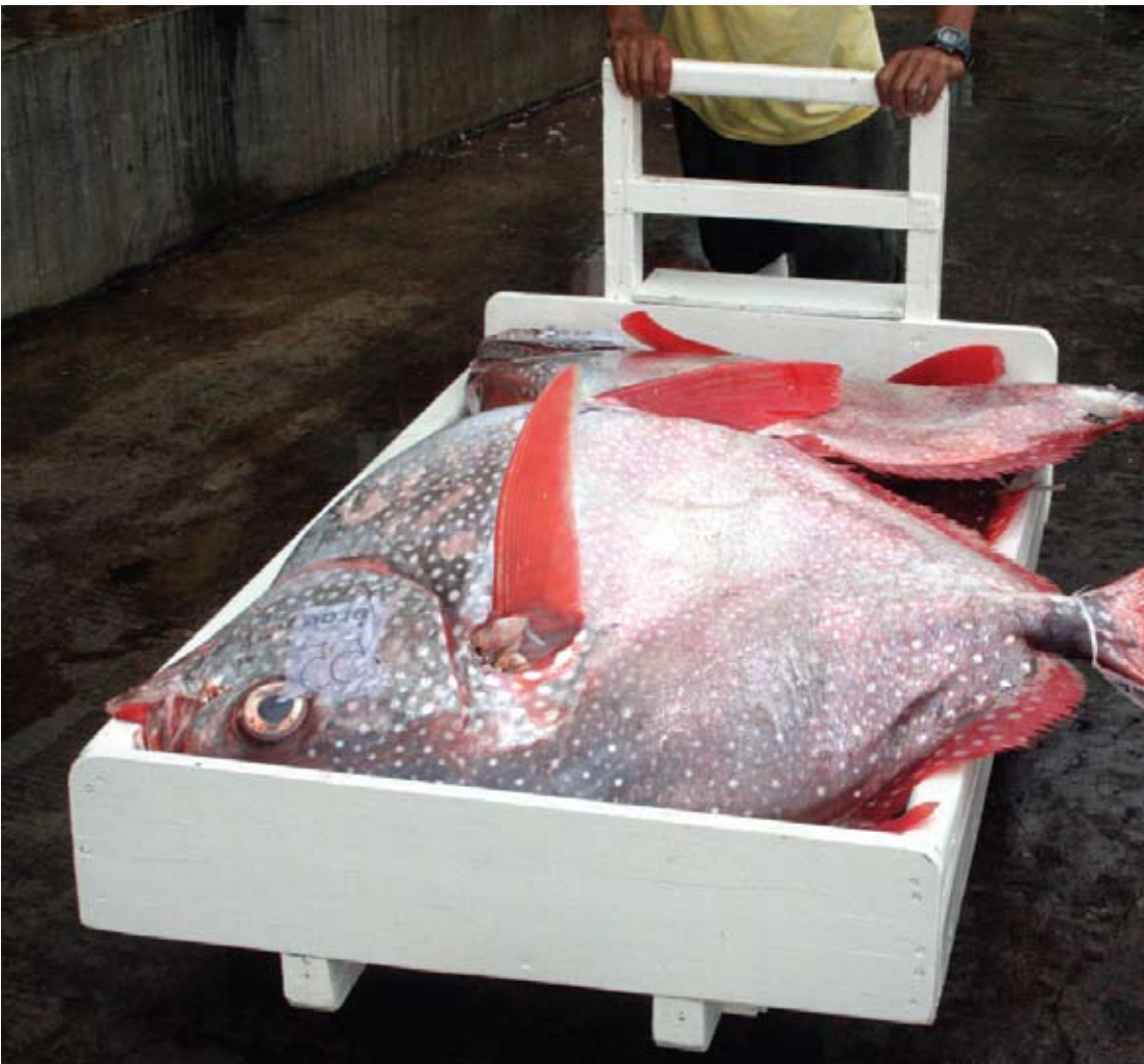
At the General Santos City Fish Port Complex, renovated and enlarged with USAID assistance, the focus is on tuna fishing. However, these moon fish also provide income for fishermen and food for local residents.