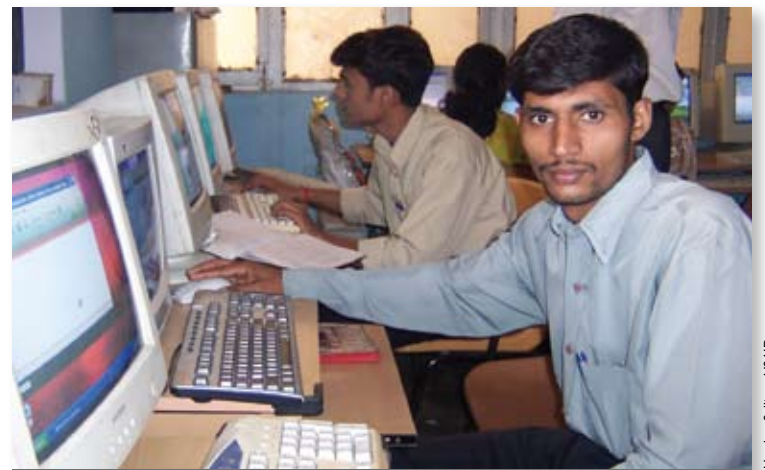
The Community and Progress Workforce Development project teaches disadvantaged youth the skills they need to get jobs in India's growing economy. USAID funds the overall program while Indian partner companies, working to ensure a viable workforce, provide financial and technical support to training centers.

Education is another area where partnerships have taken root. The Quality Education and