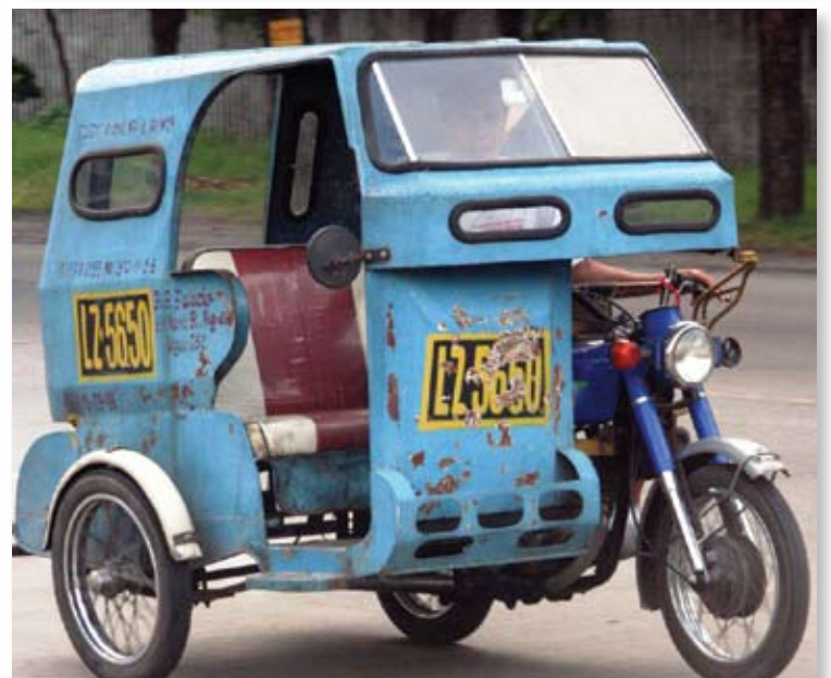
Motorcycle taxis in the Philippines provide low-cost transport not only inside cities, but also between towns. They also provide steady jobs for their drivers and for the mechanics that build and repair them.