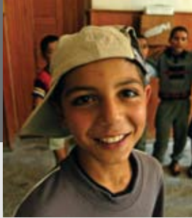
An Armenian boy enjoys activities at a center supported by USAID's Children in Especially Difficult Circumstances project.

Armenia's most vulnerable children are being assessed to determine their educational and social needs, pg. 6.