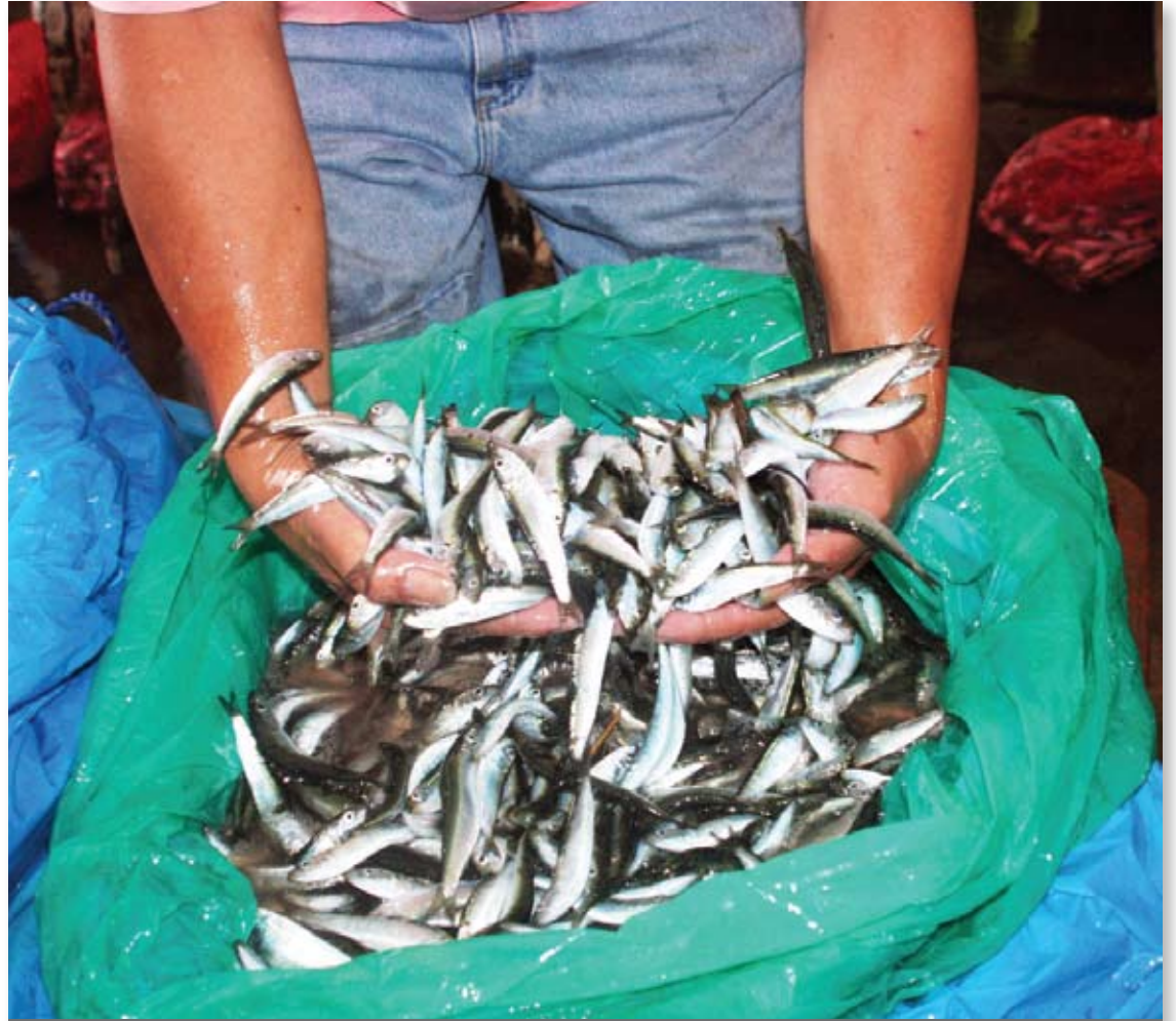
There are all kinds of fish, not only the sardines shown here, but swordfish, marlin, squid, Mahi mahi, and, of course, tuna. The port in General Santos City is responsible for supporting the tuna industry in southern Mindanao and brings in annually $400 million in fishing revenues, 100,000 jobs and $280 million in export earnings.