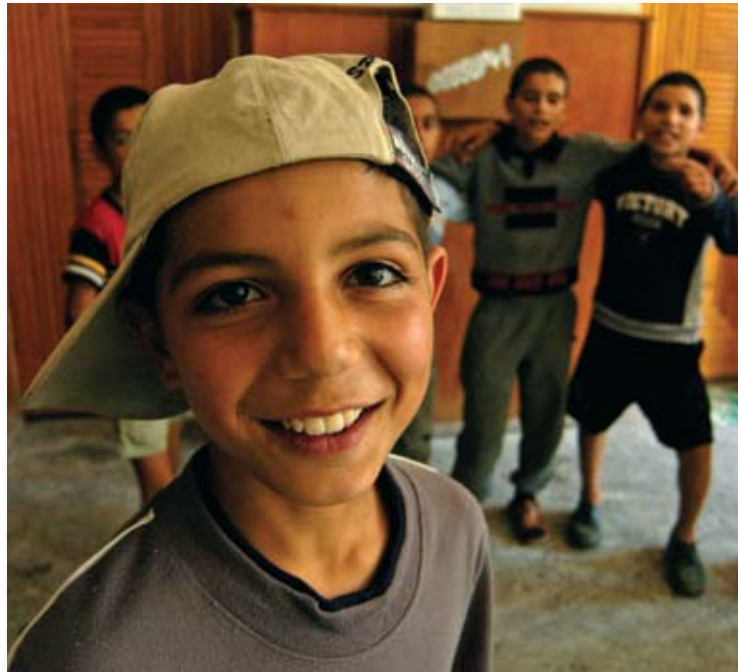
As part of its Children in Especially Difficult Circumstances project, USAID/Armenia has provided youth with the opportunity to attend summer camps where a variety of recreational activities are offered, including swimming and horseback.

YEREVAN, Armenia —Armenia has reformed its educational system in recent years, but poor and disabled children have often been left behind. Their struggling families sometimes then turn to institutional care, only to find that their children may end up in facilities designed for the disabled and lack any normal schooling.