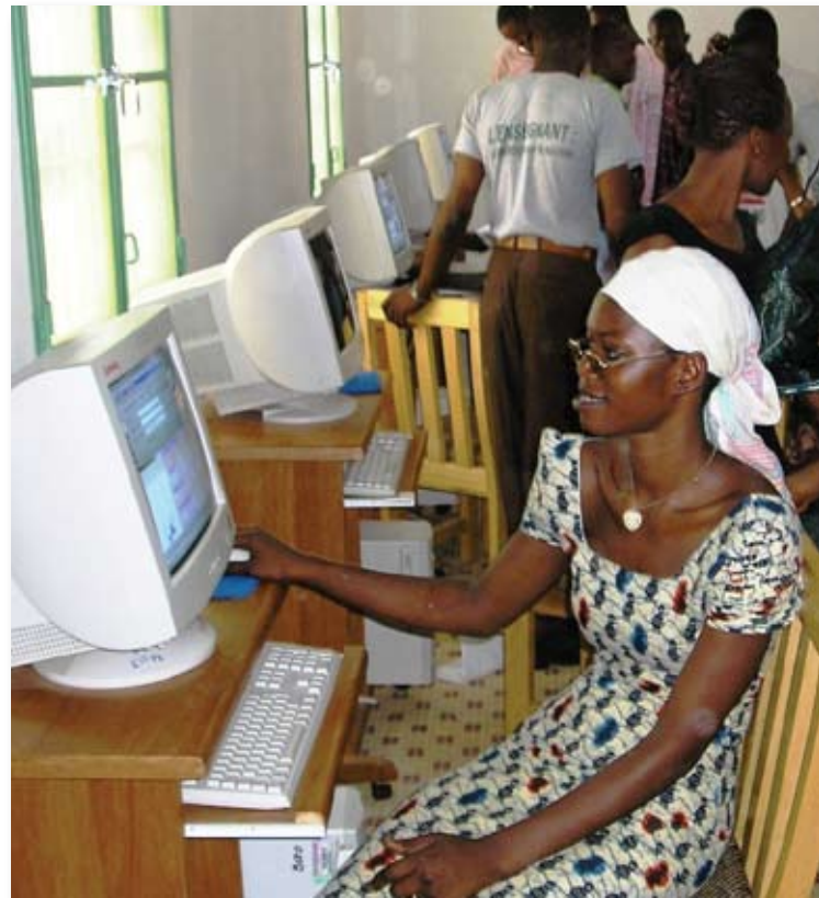
USAID-backed training for school teachers in Mali has received high marks from the educators for introducing them to ideas and strategies they can use in their classrooms.