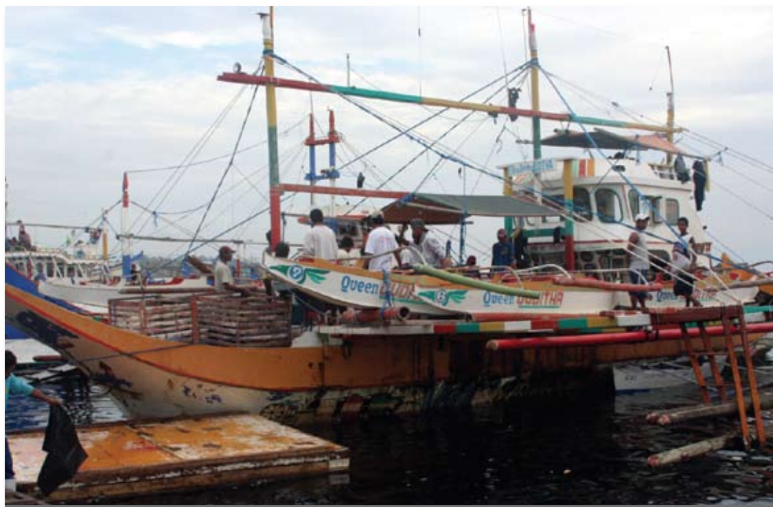
This is the municipal fishing boat or “pumpboat” Juditha, one of many such boats that operates out of the General Santos City harbor on Mindanao. With a crew of 14 to 16, these boats go out to sea for as much as 25 days, packing the fish in ice in the holds below, while the crew lives on the deck.