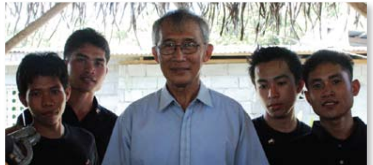
Some of the graduates from the welding school with their instructor.