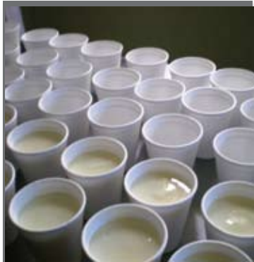
Cups of nutritious yogurt are being prepared for young children who are also participating in HIV prevention education activities.

In its nearly 20-year history as an independent nation, Namibia has invested heavily in education and health, and has been committed to promoting the economic, social, and political empowerment of historically disadvantaged Namibians. Tackling the country's HIV/AIDS epidemic is no exception. USAID delivers HIV/AIDS programs and service to Namibians in partnership with the President's Emergency Plan for AIDS Relief. Namibia is one of the Emergency Plan's 15 focus countries, and in fiscal year 2007 received $91.2 million to support HIV/AIDS prevention, treatment, and care programs.