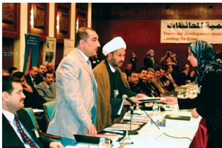
IRAQ PROVINCES WORK WITH CENTRAL GOVERNMENT. A provincial development strategy is formally presented to the Ministry of Planning at Iraq's first national provincial development strategy conference, held in Baghdad March 2. See page 7.

U.S. Agency for International Development Bureau for Legislative and Public Affairs Washington, D.C. 20523-6100 Penalty for Private Use $300 Official Business