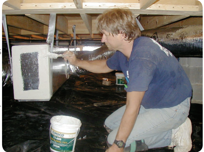
Using duct mastic helps seal ductwork, which is the most cost-effective improvement for energy savings.