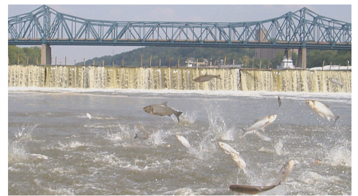
Silver carp ( Hypophthalmichthys molitrix ) is only 1 of 11 exotic species researchers are tracking as these fish invade the Upper Mississippi River System. Silver carp are a concern because of their potential detrimental affect on fish habitats and the danger they are to boaters and others on the river when they leap out of the water when the water is disturbed. Photographed below Peoria Lock and Dam, September 2005, by Melissa Smith, Illinois River Biological Station-Illinois Natural History Survey.

Exotic Species: We are tracking 11 exotic species, including a recent invader, Asian carp ( Hypopthalmichthys spp.). The greatest numbers of Asian carp are presently south of Pool 13, but are moving upriver and expanding their range.