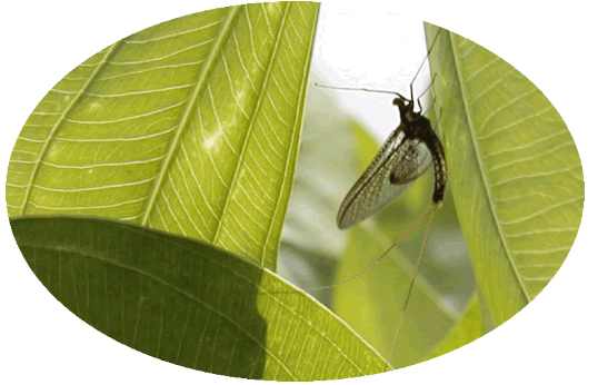
An abundance of mayflies and fingernail clams is a sign of healthy river habitats.

Not the Same River: The Illinois River rarely flows as it did historically because of impoundments and changes to its