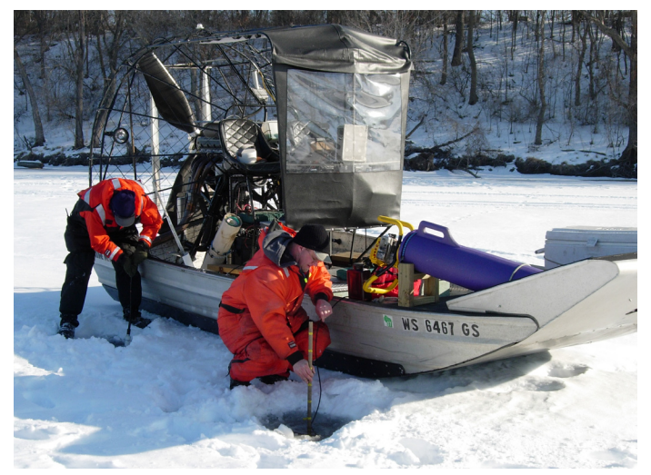
The Long Term Resource Monitoring Program is year-round work as demonstrated by this crew checking water quality under the ice.

Decline in Quality: Our studies show that total suspended sediments, turbidity, and concentrations of nitrogen,