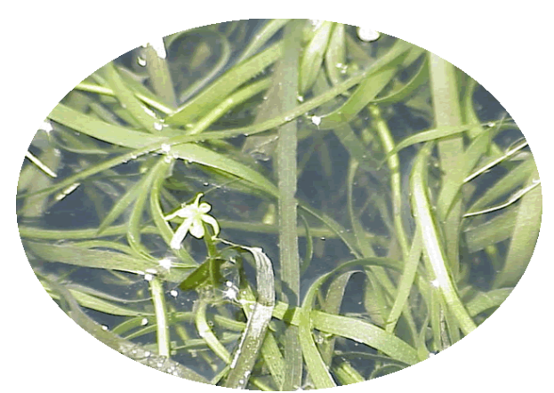
Water stargrass ( Heteranthera dubia ) provides food for some waterbirds and homes for aquatic invertebrates consumed by a variety of fish species.

Rehabilitation Pays Off: After building islands and reducing water levels during summer in Pool 8, we saw a greater growth of aquatic plants in 2001 through 2005. The rehabilitation work created new habitats and improved existing ones where plants could more easily grow and multiply.