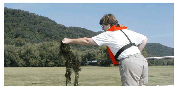
Submersed aquatic plants, according to our studies, are more abundant in the shallow, protected backwaters in the northern reaches of the Mississippi River.

Submersed aquatic plants serve wild river residents twice. Waterfowl and fish dine on some of the greens. Also, many fish hide their eggs amid the plants, their offspring use plants as shelter to hide from predators, and they feed on invertebrates that live on the plants.