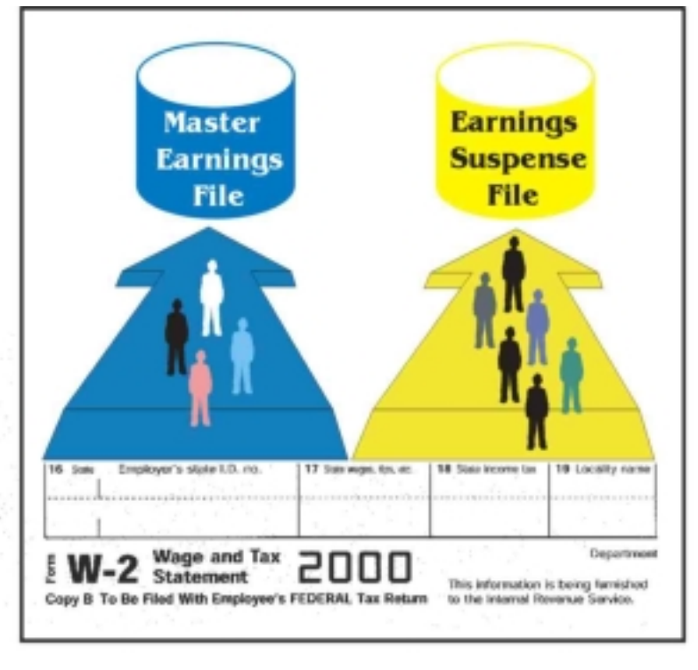
Exhibit 3: Ratio of Wage Items Posted to the MEF and ESF

The average percentage of wage items going into the ESF over the 3-year period ranged from a low of about 30 percent for one employer to a high of about 79 percent for another, as shown in Exhibit 4. Moreover, 18 of the 20 employers (90 percent) experienced increases in the percentage of suspended wage items from 1996 through 1998. The 2 employers who did not experience a percentage increase still contributed over 20,000 wage items and over $28 million to the ESF over the 3-year period.