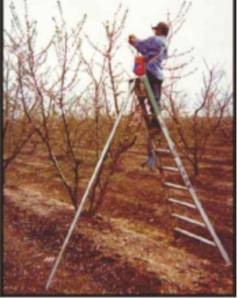
Exhibit 2: Orchard Pruning

among those noncitizens who enter the United States legally (for example, as tourists or students), many are believed to overstay their visas and take jobs. In 1996, the Immigration and Naturalization Service (INS) estimated that over 5 million unauthorized noncitizens resided illegally in the United States, and their numbers increased at an average rate of about 275,000 per year between 1992 and 1996. Many immigration experts have said that, as long as opportunities for employment exist, the incentive to enter the United States illegally or overstay visas will persist.