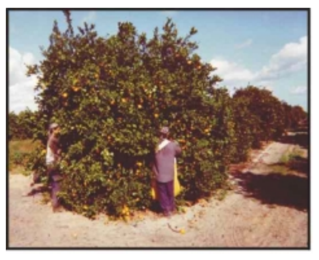
Exhibit 1: Citrus Harvesting in Florida

Earnings Suspense File (ESF). When wage items reach the ESF, SSA mails letters to employees to resolve discrepancies. SSA sends letters to the employer only if it has no address for the employee. From 1996 through 1998, the ESF grew by an average of 6.6 million wage items and $27.4 billion, annually. To address this growth, SSA developed an ESF tactical plan, which it issued in draft in 1997 and finalized in March 1999. This plan outlines the policy, operational, and system improvements SSA believes are necessary to fulfill its commitment to reduce the ESF's growth and size.