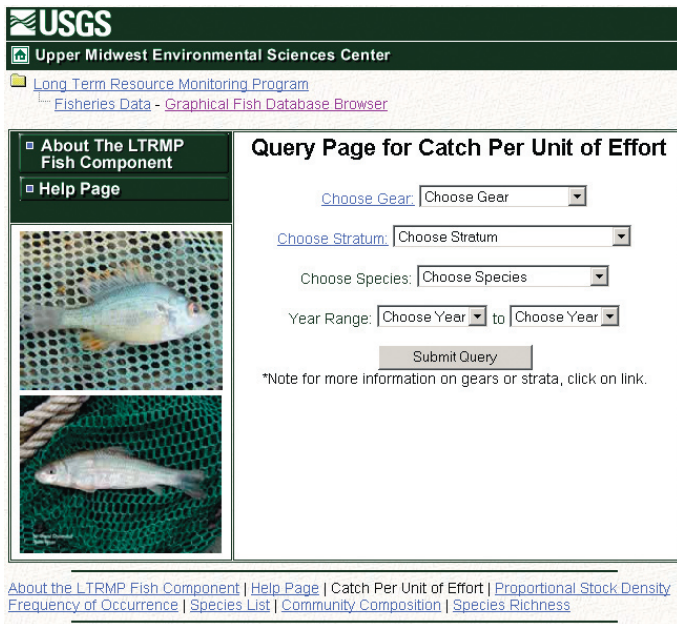
Figure 2. This is an example of a Search Page for one of the six metrics available through the Graphical Fish Database Browser (Figure 1). In this example with "Catch Per Unit of Effort," the user simply selects a gear type, a sampling stratum, a species, and a range of years in which they are interested.

es, and download a text file of the search results. These features are explained in more detail in a Help Page included with the browser ( http://www.umesc.usgs.gov/data_library/fisheries/graphical/fish_database_help.html ).