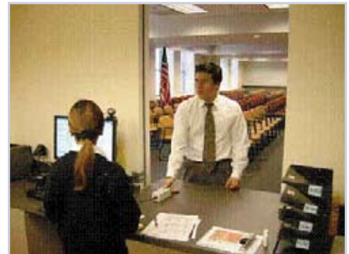
Simulation of customer being photographed at counter.

The CIV Pilots are taking place at the San Francisco, Calif; El Paso, Texas; Portland, Maine and Jacksonville, Fla. USCIS Field Offices.