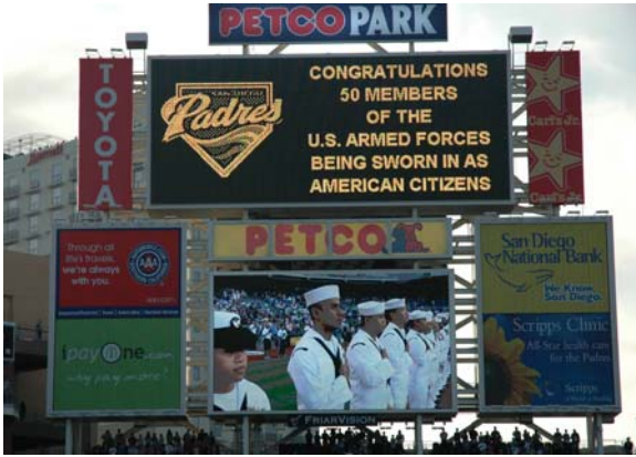
50 members of the U.S. Armed Forces were sworn in at a ceremony in San Diego, CA

More than 15,000 men, women and children in cities across the United States celebrated Independence Day by becoming America's newest citizens at more than 90 special July 4 th events Citizenship events hosted by USCIS.