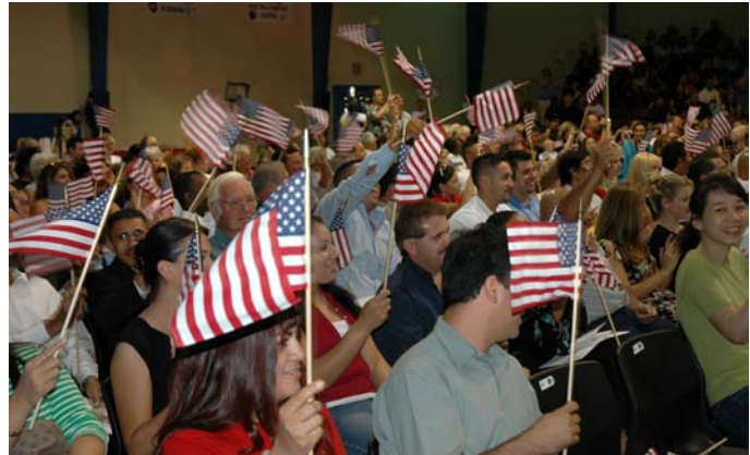
New citizens celebrate at a USCIS ceremony in Phoenix