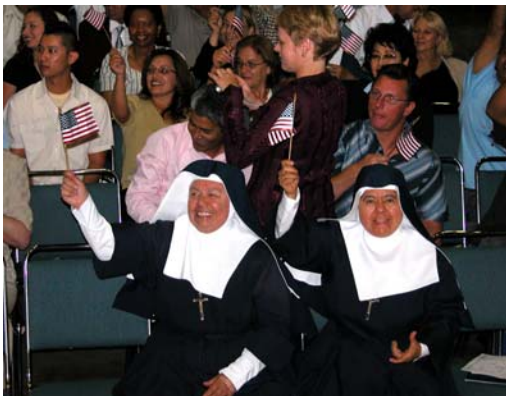
New citizens at a USCIS Ceremony in Los Angeles, CA