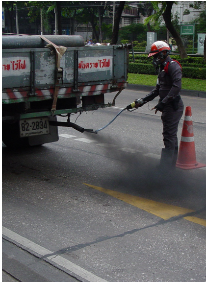
Pollution Control Department, Thailand