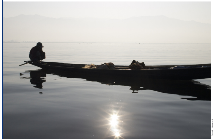
Planned development projects in the Mekong River basin will have significant transboundary impacts on the environment and river livelihoods, and may lead to regional conflict.

IMPLEMENTING PARTNERS PADCO, The Asia Foundation, U.S. Environmental Protection Agency, Mekong River Commission