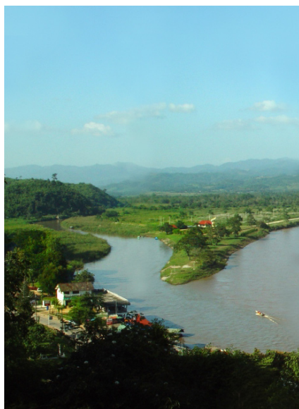
Through ECO-Asia, USAID works in target watersheds to demonstrate innovative approaches addressing transboundary conflicts.

BACKGROUND As the Mekong sub-region develops, riparian countries have been constructing dams, dikes and irrigation, and navigation waterways that significantly impact river livelihoods. A major challenge for Mekong River countries is the adoption and implementation of policies and practices that enable participatory and collaborative engagement for planning and development that support sustainable development that both protects vital ecosystems and promotes economic and social prosperity, while ensuring prevention, management and mitigation of conflict.