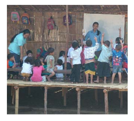
Children of Burmese migrants attend a USAID-supported school along the Thailand-Burma border.