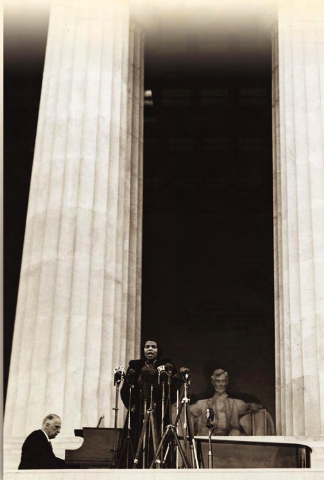
Marian Anderson singing at the Lincoln Memorial in Washington, DC, on April 9, 1939.

Perhaps the greatest tribute to the life and talent of Marian Anderson was given by her manager, Sol Hurok. He said: "In any century only a handful of extraordinary men and women are known to countless millions around the globe as great artists and great persons. Only a few inspire the adoration and respect of the mighty and humble alike. In our time there is Marian Anderson." Bravo, Marian Anderson, for the performance of your lifetime!