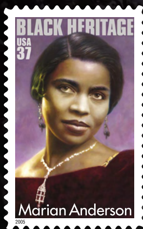
Marian Anderson Commemorative Stamp First Day of Issue: January 27, 2005