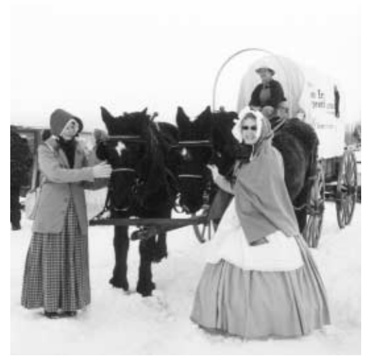
Volunteers play a major role in the National Historic Oregon Trail Interpretive Center, which celebrated its 10th anniversary in 2002. The celebration featured a wide range of activities, including a wagon train and encampment.

Also in May, the Vale District celebrated the 10th anniversary of the National Historic Oregon Trail Interpretive Center (NHOTIC). A three-day celebration featured a historically accurate wagon train with more than 20 wagons, a children's day full of pioneer-era activities, games, music, and Indian dancing, as well as a presentation on raptors featuring a live golden eagle. Speeches by Presidents Thomas Jefferson and John Tyler were just a few of the living history performances by