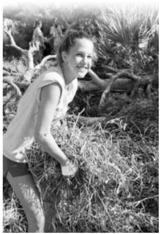
National Public Lands Day at Jupiter Inlet in Florida brought out more than 100 volunteers to clean up dead and down wood, invasive vines and seeds, and trash-enough to fill 40 pickup trucks!

events, put on education seminars, and help out wherever they were needed. Volunteers also hung flyers, talked to the media and potential adopters, helped with paperwork, monitored traffic, hosted educational and training seminars, and much more. The