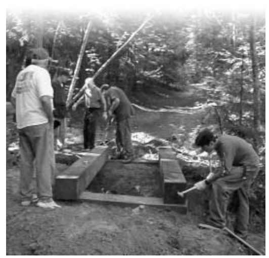
Volunteers from Ducks Unlimited and the Public Lands Foundation, along with BLM staff members, spent National Public Lands Day working on a hiking trail and planting trees at Gamlin Lake-an event sponsored by the Coeur d'Alene (ID) Field Office.

Special events were another important focus of volunteer efforts in Idaho during 2002.