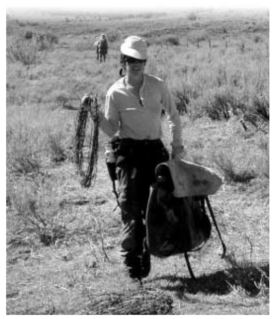
Thanks to a partnership between BLM and the Wilderness Volunteers, some three miles of fencing was removed from the Steens Mountain Wilderness Area in Oregon.

In 2002, Oregon volunteers by the thousands continued to show what it means to be active stewards of the public lands. They participated in one-day events, long-range projects, and everything else in between. National Public Lands Day (NPLD) is always celebrated with enthusiasm in Oregon, and 2002 was no exception. On the Grayback Mountain Trail, the "day" was October 27, and 50 volunteers arrived early for an organizational and safety meeting. Both seasoned veterans and new participants, the volunteers came from as far away as Eugene. A crew began work at each end of the planned trail and two crews began work in the middle. Each crew worked to meet the crew coming from the opposite direction. Existing trail was brushed and more than one-half mile of new trail was built. When completed, the Grayback