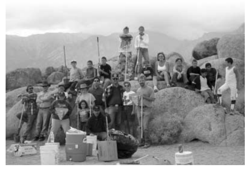
National Public Lands Day in the Bishop, California, area saw volunteers participating in a cleanup in the Alabama Hills, a popular destination for rockclimbers.

The American Hiking Society sponsored three separate weeks of "volunteer vacations" in the King Range National Conservation Area during 2002. During these working vacations, volunteers accomplished many projects. They performed maintenance on approximately 11 miles of upland trails, bringing them up to standard through brushing, trail-bed widening, water-bar installation, and rock work. These dedicated hikers also rerouted an additional one-half mile of new trail, installed and painted signs, and collected litter, which they either packed out or prepared for hauling out by boat. In addition, all major campsites along the 25-mile Lost Coast were cleaned and their fire rings removed or upgraded.