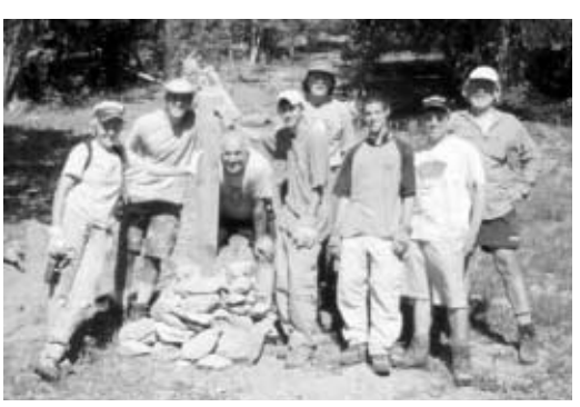
Members of the American Hiking Society devoted six weeks to making trail improvements on the Idaho portion of the Continental Divide National Scenic Trail.

For more than 25 years, the Coeur d'Alene Field Office has sponsored Eagle Watch Week, an event to view and count wintering bald eagles on Coeur d'Alene Lake. Volunteers greet visitors, answer questions, and hand out brochures. In 2002, 105 eagles were counted (an all-time high) with about 4,800 visitors watching the eagles perch in nearby trees and swoop down on the kokanee salmon in the lake.