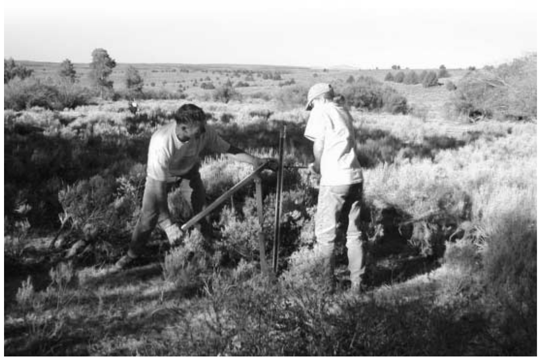
Volunteers from the group Wilderness Volunteers helped remove several miles of fencing from the Steens Mountain Wilderness Area in the Burns (OR) District.

The individual state and center reports include lists of partners selected for special mention by BLM field offices for their contributions to BLM programs in 2002. Partnerships greatly enhance BLM's ability to get the job done, and BLM is grateful to all our partners for their dedication to the public lands.