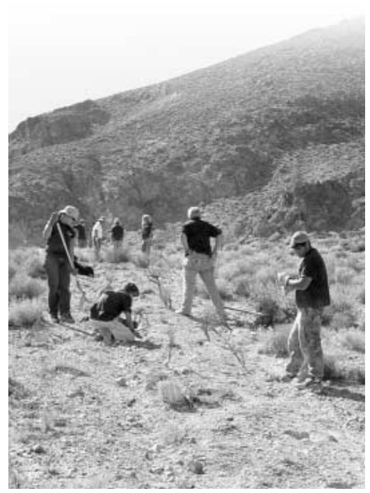
Volunteers, including members of AmeriCorps, Burning Man, Friends of the Black Rock-High Rock Desert, and Friends of Nevada Wilderness, cleaned up almost 3,000 pounds of trash from the Black Rock Desert on National Public Lands Day 2002.

Each year, the BLM Nevada field offices attract more and more people interested in helping to care for the nation's public lands. The year 2002 was no exception. The ghost town of Rhyolite was one of the major beneficiaries of volunteer efforts, with three caretaker/host teams contributing more than 22,000 hours. These volunteers live onsite, giving interpretive tours and providing a