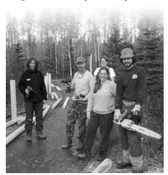
Although plans for National Public Lands Day included having work crews install only support posts for a fence near the Campbell Creek Science Center, enthusiastic volunteers got the entire fence built.

Alaska is a big state, but once again in 2002, BLM volunteers seemed to have it covered from archaeological research in remote northern and eastern regions to cleanup projects and educational events at Campbell Creek in Anchorage. As in previous years, the Northstar Volunteer Fire Crew was the highlight of the volunteer program at BLM/ Alaska Fire Service (AFS). By introducing Native Alaskans and other minorities to the Bureau fire program, the crew continued to serve as an effective recruiting mechanism. Crew members received Emergency Firefighter wages while on fire assignments and gained valuable experience required for