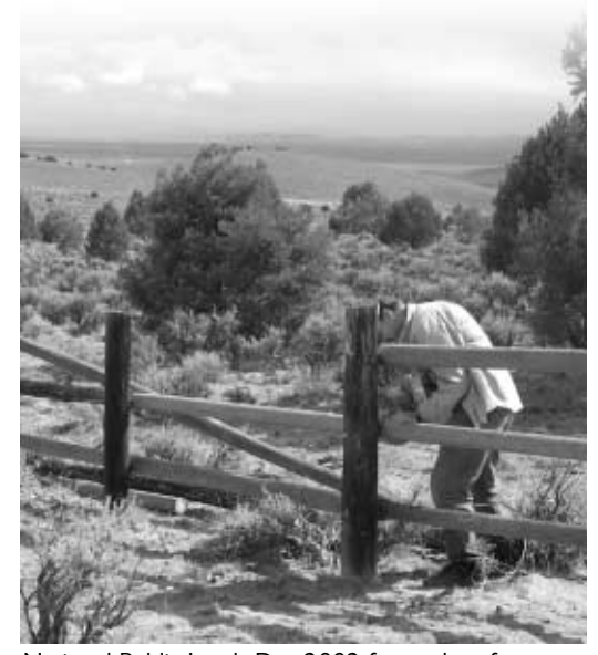
National Public Lands Day 2002 focused on fence building in the Battle Mountain District in Nevada.

NPLD was celebrated at many other sites throughout Nevada, including the Swan Lake Nature Study Area outside of Carson City. Following an early morning wildlife tour of the area, more than 50 volunteers engaged in trail building, installation of interpretive signs, and general cleanup projects. Partners and sponsors at the Swan Lake site included the Lahontan Audubon Society, Nevada Office of the Military, Washoe County Parks and Recreation, Washoe County School District, City of Reno, Nevada Land Conservancy, and the BLM Carson City Field Office. The partners executed a memorandum of understanding to preserve the wildlife habitat and marsh