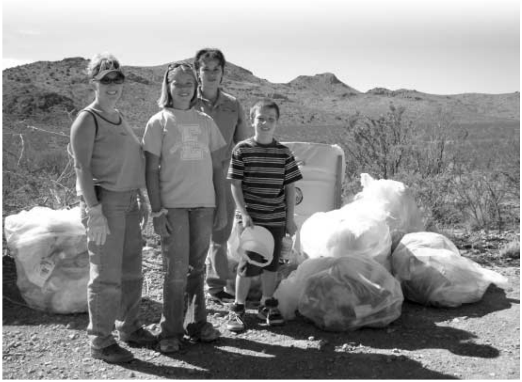
On National Public Lands Day 2002, 4-H Club volunteers for the Safford (AZ) Field Office gathered 15 large sacks of litter at the Black Hills Rockhound Area.