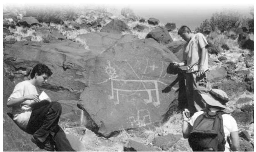
Young American Indians from the Intermountain Youth Center used GPS, digital photography, and written documentation to inventory rock art on the boulders and cliffs of Black Mesa near Velarde, New Mexico.

National Public Lands Day saw celebrations and hard-working volunteers at several events in New Mexico. Volunteers from the mountain biking community and the city of Carlsbad contributed nearly 200 hours doing trail maintenance and cleanup of unauthorized dumping on the Carlsbad Mountain Bike Trail. The city of Carlsbad donated dumpsters for the effort. And near Amarillo, Texas, 24 volunteers assisted in ongoing reclamation efforts on the only BLM public lands in the State of Texas. After years of abuse and neglect, the Cross Bar public lands are in desperate need of attention. They experience an estimated 10,000 visitor days each year. Off-highway vehicle activity in three canyons running through the lands has created large areas of erosion and disturbance of other