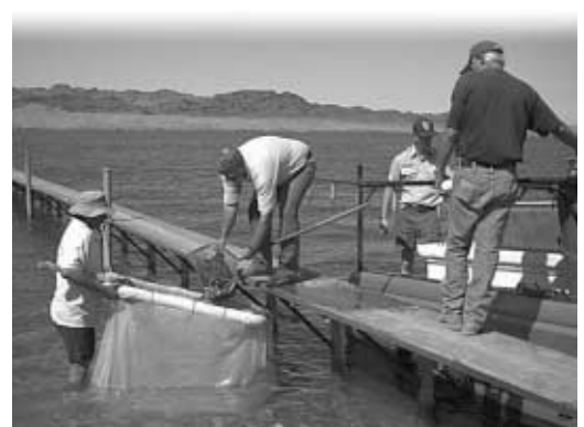
Habitat improvements are important for fish as well as for anglers. In 2002, volunteers and partners stocked Lake Havasu with bonytail chub in an effort to improve the outlook for this endangered fish.

NPLD 2002 at the Arizona Strip Field Office saw 60 volunteers assisting BLM personnel at the Nampaweap Rock Art Site. When the