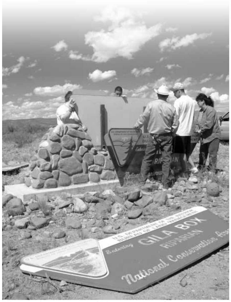
Volunteers replace entry signs at the Gila Box Riparian National Conservation Area. This was one of many 2002 National Public Lands Day projects in Arizona.