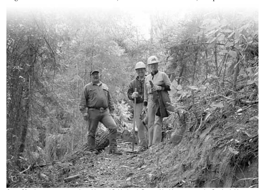
Some 50 volunteers participated in a National Public Lands Day trail-building event on the Grayback Mountain Trail in Oregon's Medford District. When completed, the trail will provide access to more than 2,500 miles of trail in the western United States.

Student volunteers played a major role in other areas too. Four members of the Student Conservation Association (SCA) volunteered in the fisheries program in the Eugene District. In the Butte Falls Resource Area of the Medford District, high school students took part in service learning, educational, and restoration projects focused on improving the Upper and Lower Table Rock areas, which feature a high usage, educational trail system. Three Crater High School students pulled moth mullin, prickly lettuce, and fireweed from over 10,000 square feet of the