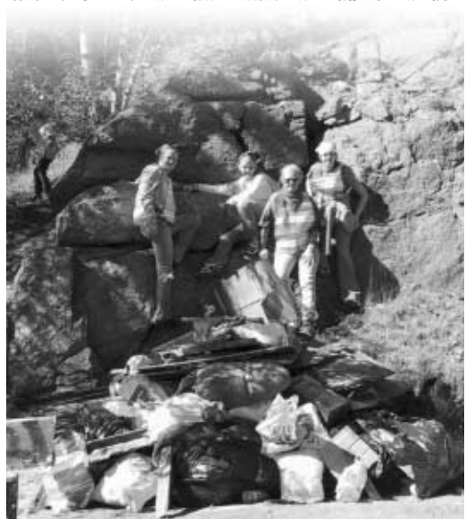
The Royal Gorge Field Office coordinated three National Public Lands Day events in 2002, including a cleanup of the Upper Phantom Canyon Road on Colorado's Gold Belt Tour National Scenic Byway. A partnership with two all-terrain vehicle groups helped make the day a great success.

Three local events occurred in conjunction with the ninth annual National Public Lands