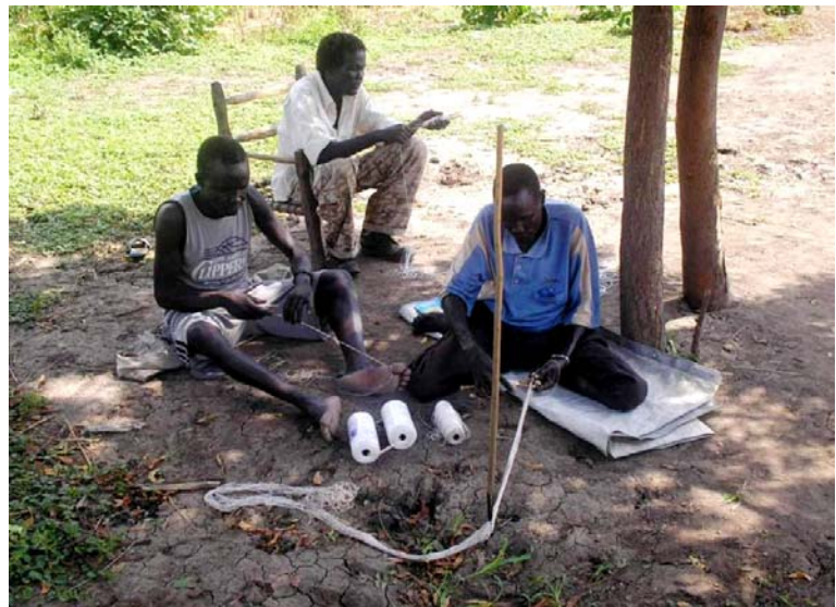
Fisherman in Mandeng, Upper Nile, weave nets with twine distributed by USAID partner FHI.

Although recent insecurity forced FHI to evacuate staff from Malakal and Mandeng, work continues. As the dry season begins in Southern Sudan, FHI will conduct additional extension training focusing on agricultural preparation for the dry season and continue distributing agricultural equipment, vegetable seeds, and irrigation equipment to conflict-affected families throughout Upper Nile. ♦