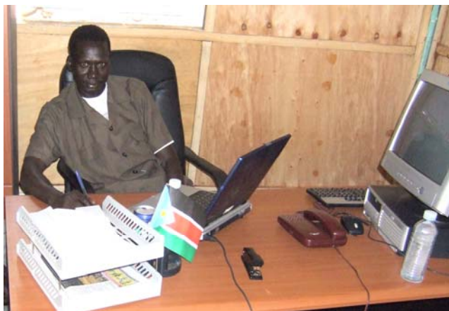
USAID equipped 10 state statistics offices in Southern Sudan to support the upcoming census.

A census is the largest statistical operation that a country can conduct, and the challenges of planning