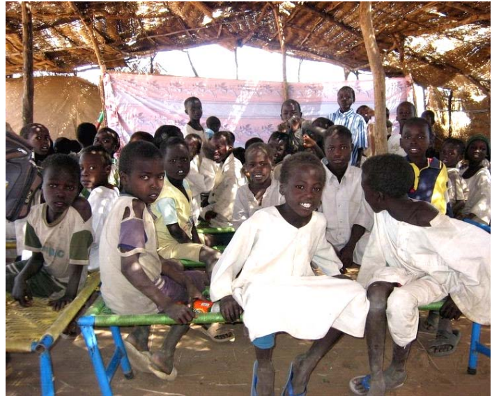
USAID works with youth in Darfur's camps to promote peace and raise awareness of issues like violence against women.

Not only do these activities help give idle youth positive and productive pursuits, they may also dissuade them from participating in other activities that would create further insecurity in the camps and could jeopardize the provision of humanitarian assistance. ♦