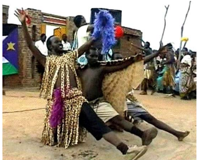
Dramatic performances along Sudan’s North-South border disseminate messages of peace.

Despite the signing of the Comprehensive Peace Agreement (CPA) in January 2005, ethnic tensions continue to foster volatility in states along Sudan’s North-South border. Strained relations among