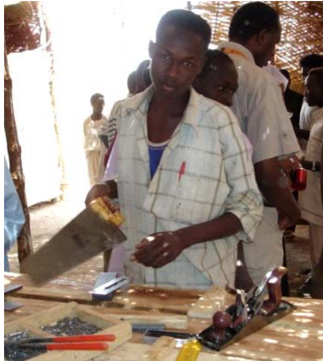
A young man in Otash camp in South Darfur is training in carpentry.

Camp residents say they are grateful for the resources and services that USAID-supported youth centers are providing.