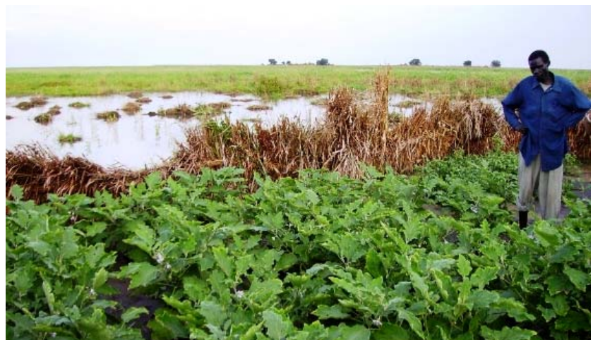
Farmers grow eggplant and other vegetables at a USAID-supported demonstration farm in Nasir, Upper Nile.

The Three Areas are Abyei, Blue Nile, and Southern Kordofan.