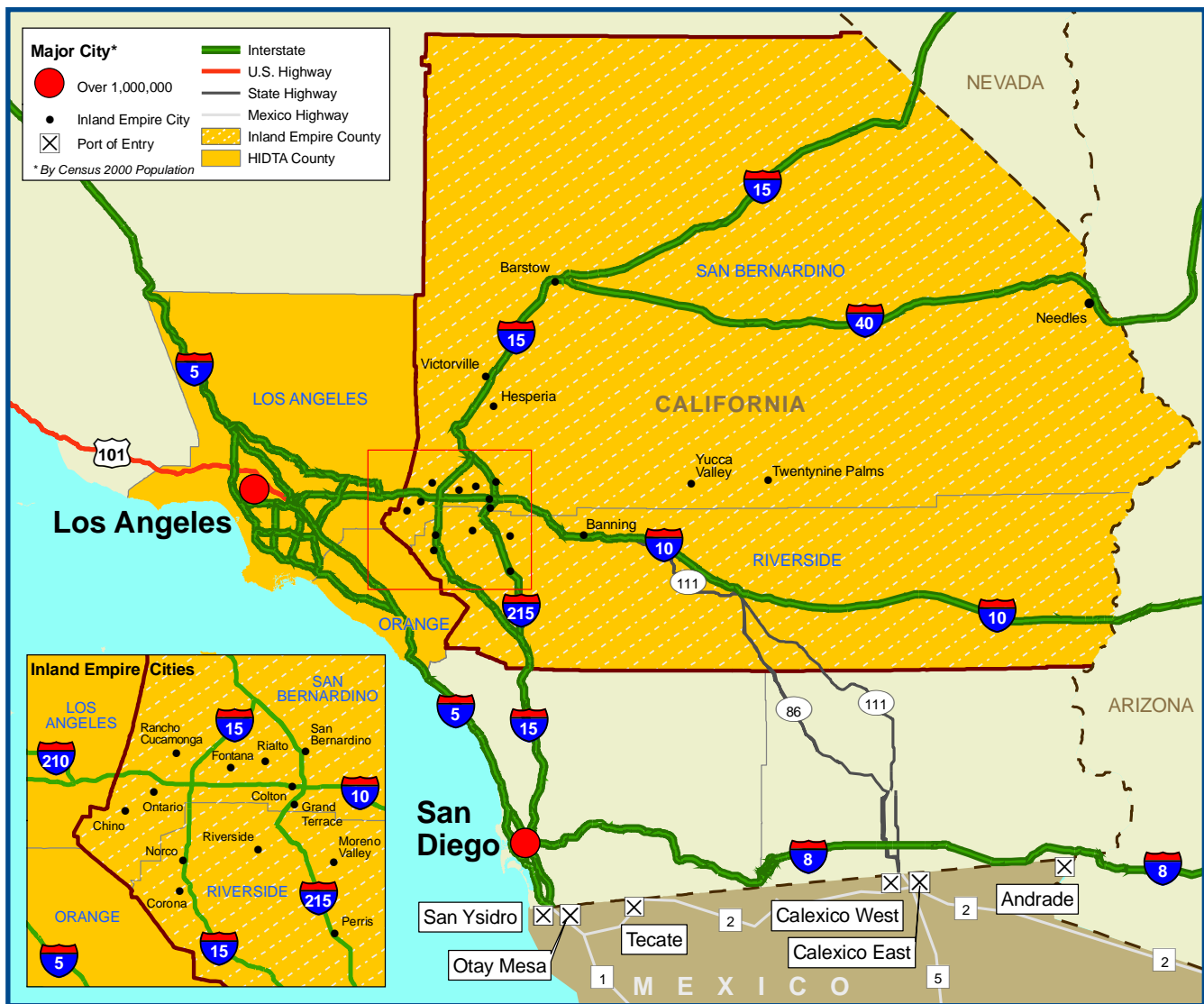
Figure 1. Los Angeles High Intensity Drug Trafficking Area.

This assessment provides a strategic overview of the illicit drug situation in the Los Angeles High Intensity Drug Trafficking Area (HIDTA) region, highlighting significant trends and law enforcement concerns related to the trafficking and abuse of illicit drugs. The report was prepared through detailed analysis of recent law enforcement reporting, information obtained through interviews with law enforcement and public health officials, and available statistical data. The report is designed to provide policymakers, resource planners, and law enforcement officials with a focused discussion of key drug issues and developments facing the Los Angeles HIDTA.