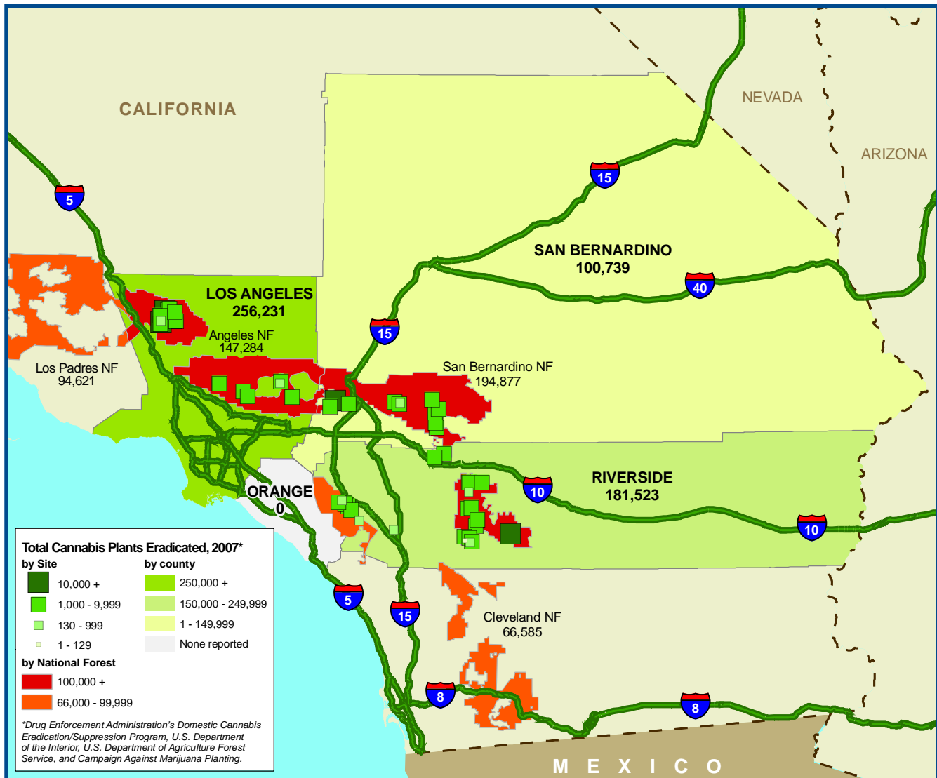
Figure 2. Outdoor cannabis cultivation areas in the Los Angeles HIDTA region.

African American and Hispanic criminal groups and street gangs, often Bloods and Crips sets, are the principal crack and PCP producers in the Los Angeles HIDTA region. They typically convert powder cocaine into crack cocaine in low-income, inner-city neighborhoods as needed for distribution, primarily to avoid stiff penalties associated with distribution of large quantities of the drug. They most often produce PCP in the Los Angeles, Compton, and North Long Beach areas of Los Angeles County and, more recently, in the high desert areas of San Bernardino County