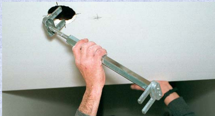
Remodeling bracket fits through a 4-in. hole.