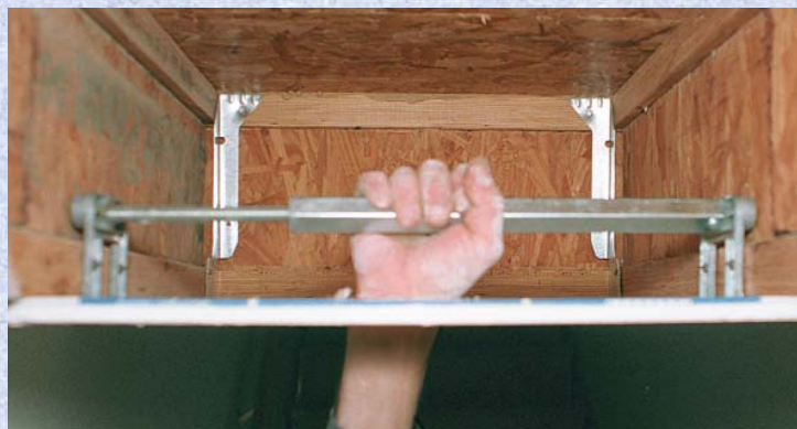
Wrist action tightens bracket securely between joists.