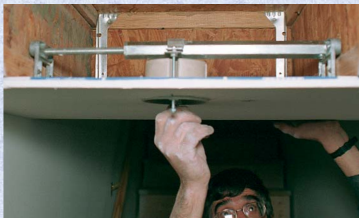
Specially designed ceiling box hangs from bracket.