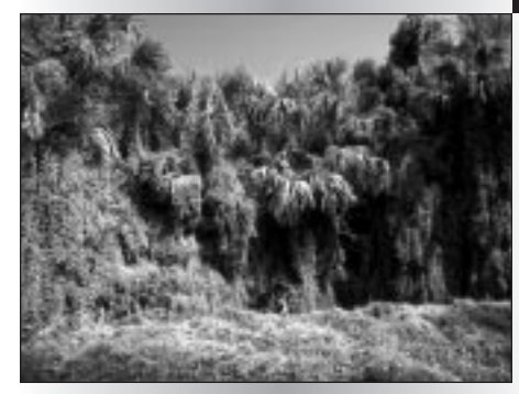
Old World Climbing Fern (exotic)

To participate in the Forum, please visit http://sofia.usgs.gov . For information by telephone, call Heather Henkel 727-803-8747 , extension 3028 .