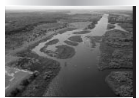
Kissimmee River canal and test fill