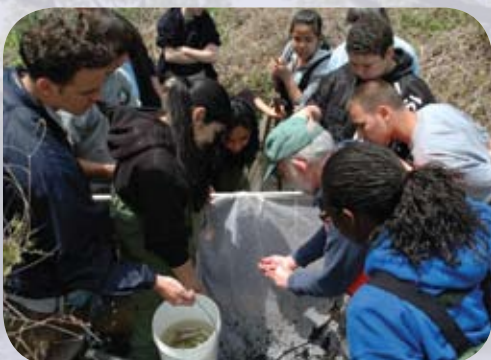
Saunders High School and St. Christophers’ students working with Lehman College professors, collecting fish for the 2008-2009 fish study.