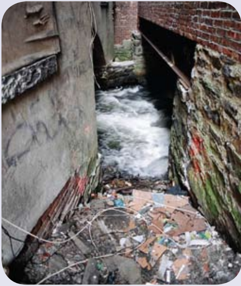
A major initiative is underway to “daylight” sections of the Saw Mill River in Yonkers, which were previously buried underneath buildings. This photo shows the river underneath businesses.