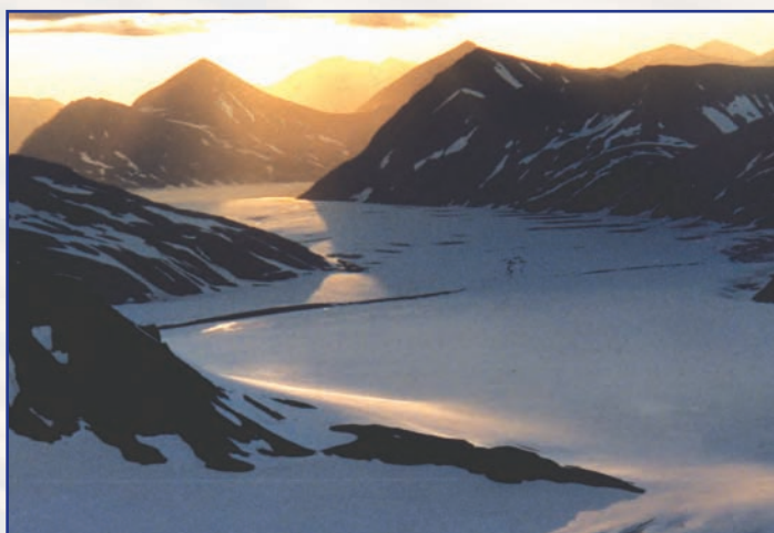
Sunset over the Kenai.