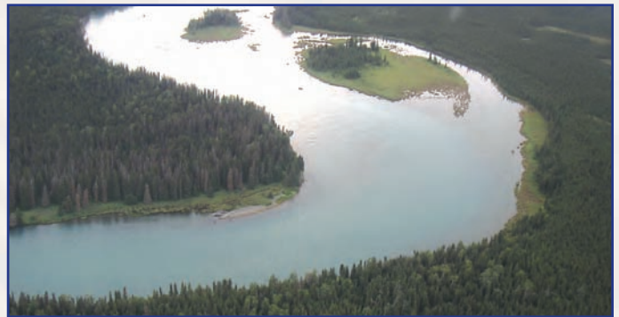
The Kenai River supports numerous recreational activities, including world class salmon fishing.