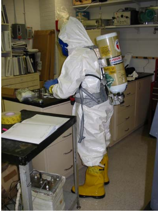
Figure 6-1. Side View of PPE Worn by Non-Technical Operator