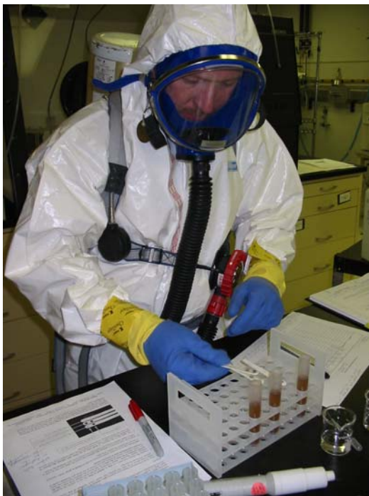
Figure 6-2. Testing of the OP-Stick Sensor with the Non-Technical Operator Wearing PPE