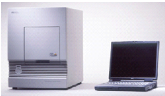
Figure 2-1. Applied Biosystems' ABI Prism® 7000 Sequence Detection System

The TaqMan® E. coli O157:H7 Detection Kit is part of an integrated system that includes polymerase chain reaction (PCR) chemistry, instrumentation, and data analysis software. Each TaqMan® Detection Kit contains TaqMan® probes and primers in the PCR mix along with MgCl 2 , dNTPs, and an internal positive control (IPC) system. The ABI Prism® 7000 Sequence Detection System is a real-time PCR fluorescence detection instrument that combines a thermal cycler with an optical detection system. During amplification, it can distinguish between the fluorogenic labels for the assay target (i.e., E. coli O157:H7) and an IPC. The ABI Prism® 7000 uses a microplate capable of running 96 samples. The PrepMan™ Ultra Sample Preparation Reagent removes the inhibitory and interfering substances that potentially affect PCR amplification and lead to inconclusive results.