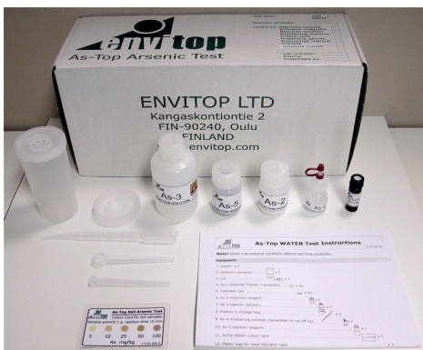
Figure 2-1. Envitop Ltd. As-Top Water Arsenic Test Kit

The complete As-Top Water test kit contains reaction vessels, an As-1 filter sulphide trap, an indicator cap with test paper, an As-2 reduction reagent, an As-4 moistening solution, As-3 and As-5 reaction solutions, disposable pipettes, two measuring scoops, and a color comparison card. The color comparison card for the As-Top Water test kit reads 10 parts per billion (ppb), 30 ppb, 50 ppb, 70 ppb, 100 ppb, 300 ppb, and 500 ppb. The limit of detection of the test kit, as stated by the vendor, is 10 ppb for water samples.