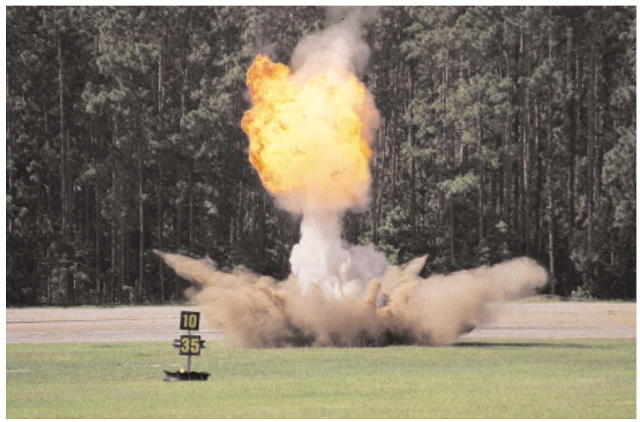
Part of an Advanced Explosives Destruction Techniques (AEDT) training class at Fort AP Hill, Virginia.

ATF employees provided regular briefings on cigarette trafficking trends and schemes to local, State, and Federal law enforcement and