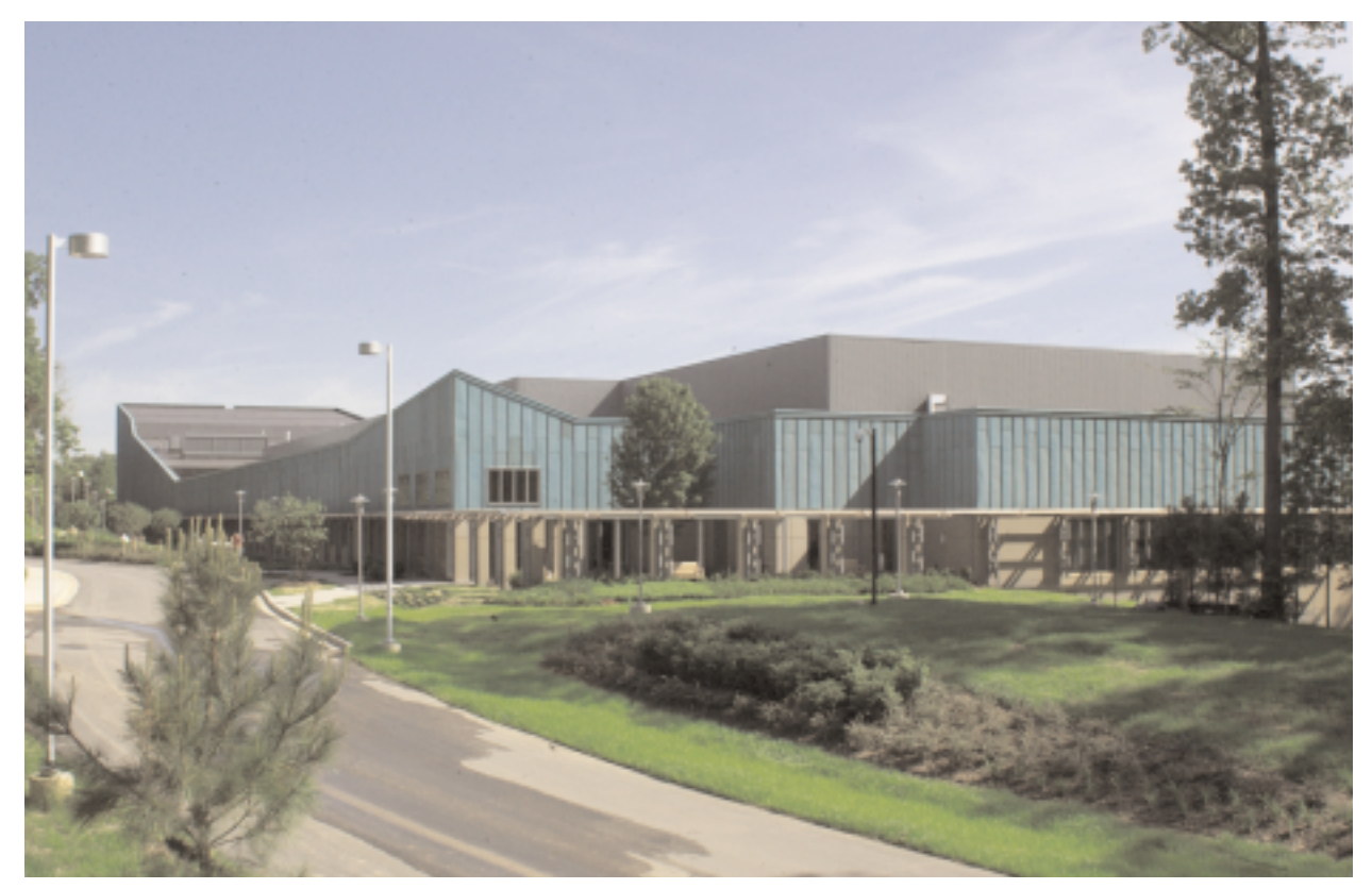
The new National Laboratory Center at Ammendale, Maryland.

The NLC provided key forensic support in the DC area sniper investigation in October-November of 2002. The expertise of the ATF firearms examiners, fingerprint specialists, and forensic chemists was used at all sniper shooting scenes. An ATF firearms examiner processed all of the ballistic evidence associated with the investigation. The NLC also deployed the mobile laboratory to many of the sniper shooting scenes.