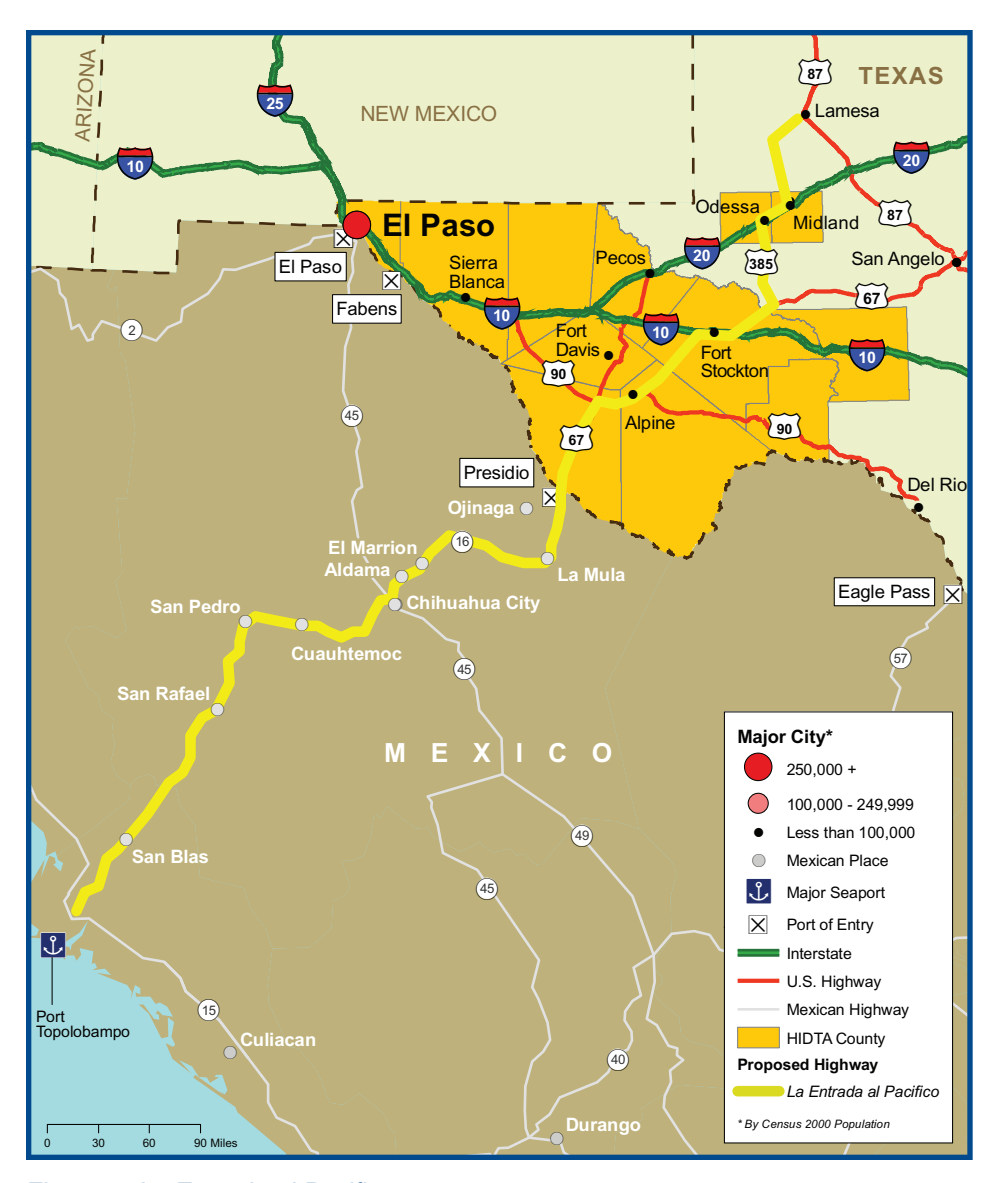
Figure 2. La Entrada al Pacifico.

Mexican Government has switched its emphasis to a new border road project that would construct a highway from Presidio to Del Rio as well as all along Mexico's northern border. Construction of this roadway will give DTOs better access to long stretches of the border where currently there are only rough or nonexistent roads.