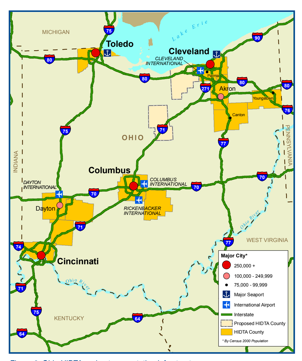
Figure 2. Ohio HIDTA region transportation infrastructure.

levels. Mexican traffickers have also replaced African American criminal groups as the primary wholesale-level distributors of cocaine, marijuana, and heroin in Dayton. The overall availability of heroin in Dayton has increased significantly; law enforcement officials report that prior to the recent influx of Mexican heroin, kilogram quantities of heroin were not available in the city.