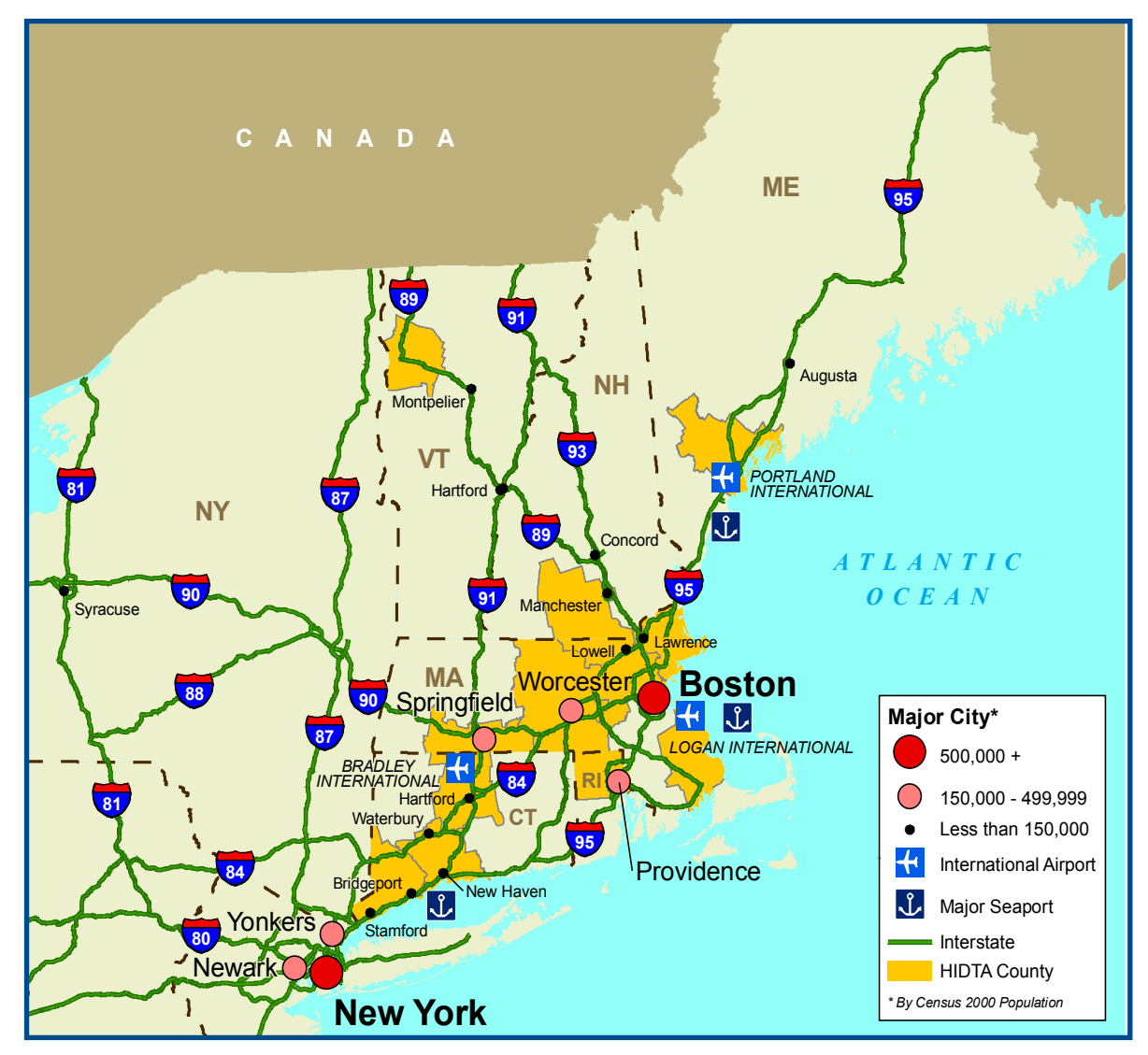
Figure 2. NE HIDTA region transportation infrastructure.