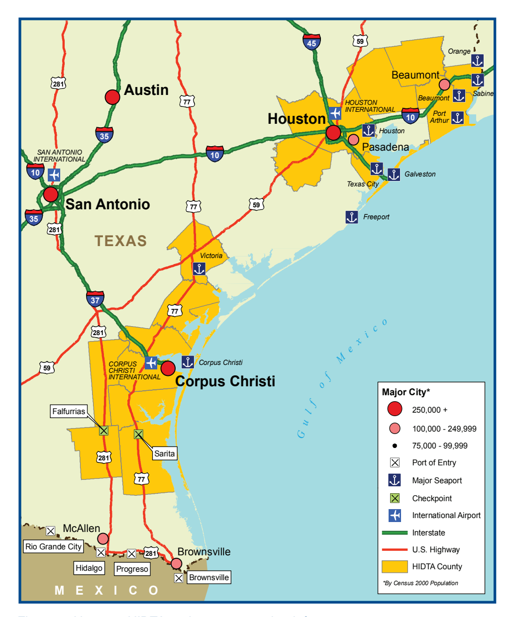
Figure 2. Houston HIDTA region transporation infrastructure.

the Houston area, will quite likely be used by Mexican DTOs upon its completion to smuggle drug shipments.