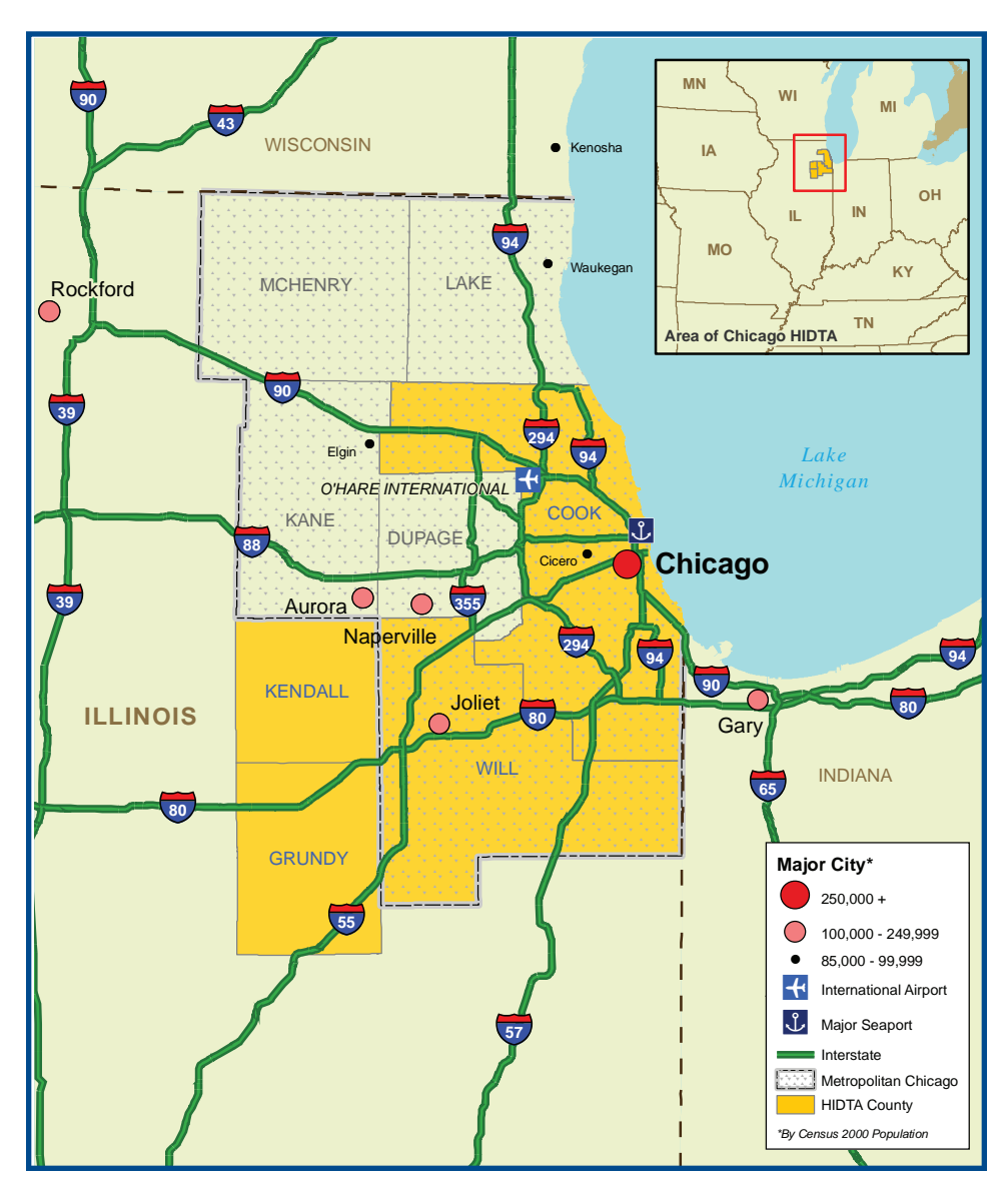
Figure 1. Chicago High Intensity Drug Trafficking Area.

This assessment provides a strategic overview of the illicit drug situation in the Chicago High Intensity Drug Trafficking Area (HIDTA), highlighting significant trends and law enforcement concerns related to the trafficking and abuse of illicit drugs. The report was prepared through detailed analysis of recent law enforcement reporting, information obtained through interviews with law enforcement and public health officials, and available statistical data. The report is designed to provide policymakers, resource planners, and law enforcement officials with a focused discussion of key drug issues and developments facing the Chicago HIDTA.