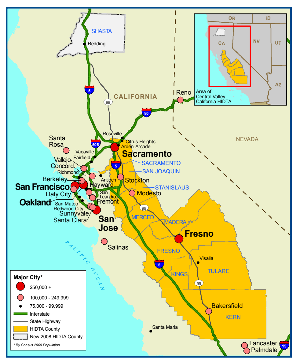
Figure 1. Central Valley California High Intensity Drug Trafficking Area.

This assessment provides a strategic overview of the illicit drug situation in the Central Valley California (CVC) High Intensity Drug Trafficking Area (HIDTA), highlighting significant trends and law enforcement concerns related to the trafficking and abuse of illicit drugs. The report was prepared through detailed analysis of recent law enforcement reporting, information obtained through interviews with law enforcement and public health officials, and available statistical data. The report is designed to provide policymakers, resource planners, and law enforcement officials with a focused discussion of key drug issues and developments facing the Central Valley California HIDTA.