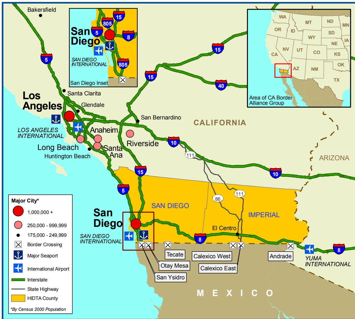
Figure 1. California Border Alliance Group region.

This assessment provides a strategic overview of the illicit drug situation in the California Border Alliance Group (CBAG) region of responsibility, highlighting significant trends and law enforcement concerns related to the trafficking and abuse of illicit drugs. The report was prepared through detailed analysis of recent law enforcement reporting, information obtained through interviews with law enforcement and public health officials, and available statistical data. The report is designed to provide policymakers, resource planners, and law enforcement officials with a focused discussion of key drug issues and developments facing the CBAG region.