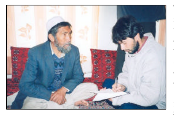
Figure 2: Interviewing a male drug user

The interviewers were provided with a list of preferred types of key informants that should have lived in their target area for at least one year. They were, in descending order of importance: doctors; other healthcare staff; NGOs providing healthcare services; Wakili Guzars/Local Government Administrators; mullahs; police; school teachers; pharmacists; taxi drivers; shopkeepers/restaurant owners. Random sampling was then used to select the key informants from these occupational groups.