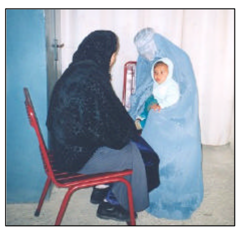
Figure 3: Interviewing a female drug user

Most importantly, in terms of the reliability of the results of the assessment, both key informants and drug users consistently gave estimates of number of drug users only for the particular locale they lived in and not