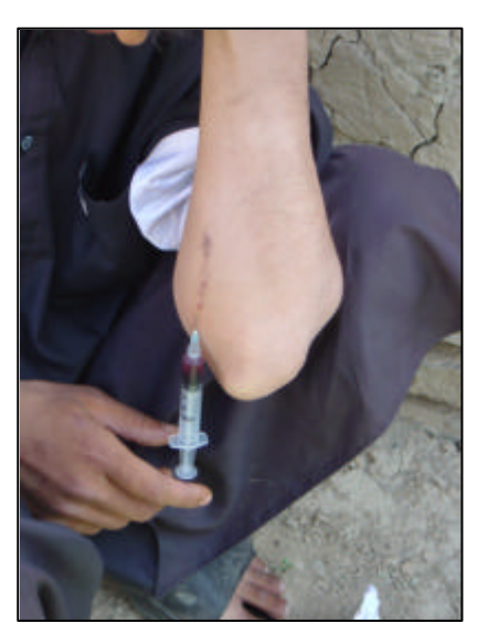
Figure 5 : A Kabul heroin user 'flushing' his syringe

Heroin users reportedly spend between 30 and 250Afs (US$0.60 and US$5.00) per day on the drug, the variation most likely depending on the size of their habit, although it may also reflect different prices for the drug at different retail outlets throughout the city. This is a considerable amount of money to be spent on drugs for low income impoverished families. Weights and measures of heroin provided by drug users are not reliable and vary considerably, for example, one gram was cited as being equivalent to 5 poris, 8 poris, 10 poris and 20 poris by different users. Most users worked at various jobs to earn money to pay for their heroin, although stealing from family members, stealing from the bazaar, begging and being given money by relatives were also cited.