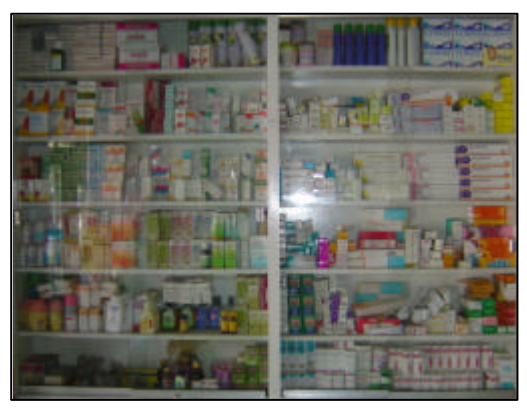
Figure 8: A Kabul pharmacy

Just over half of the key respondents reported the use of pharmaceutical drugs in their area, with most of the others saying they didn't know whether such drugs were used or not, suggesting that the use of such drugs is less 'public' and unlikely to be consumed in the company of others, as is often the case with hashish and heroin. One key informant said that "people are now educated through the media and health education in clinics not to use medicine without a medical prescription", although evidence would tend to suggest that this is not the case and that many people self-medicate with a range of pharmaceutical preparations without