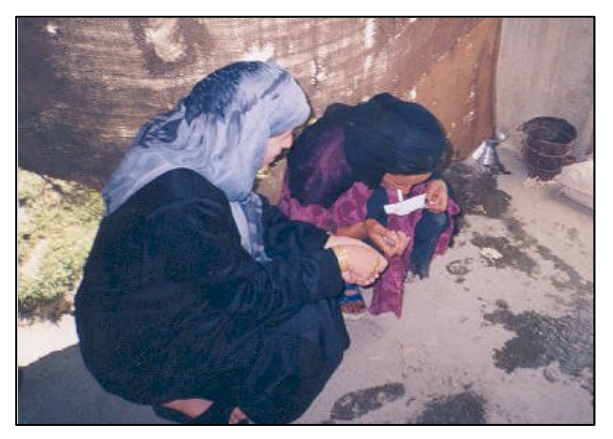
Figure 4: Taking heroin by 'chasing the dragon'

Over a third of the 200 drug users (n=74) had used heroin, including 3 women. Nearly 50% of this group (n=34) had started their heroin use in Iran (n=17) or in Pakistan (n=17), with 35% starting in Kabul and a further 3 people starting elsewhere in Afghanistan, two of these in Qandahar. Forty percent had been using heroin for between 3 and 6 years, with a further 21% (n=16) using for more than 7 years. Five of these people claimed to have been using heroin for over 20 years. The majority used heroin 2-3 times daily, with 6 people claiming that they used it more than 4 times daily. Apart from one man, all those who had started to use heroin had continued to