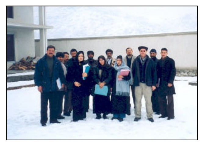
Figure 1: Interview team

a 5-day training programme on research methodology before conducting comprehensive interviews with 100 key informants and 200 drug users in Kabul city.