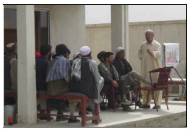
Figure 10 : A pre-treatment motivational counseling group at Nejat Centre

a parent, "I cannot even think about my children, I am useless". It is such feelings of exclusion from the family and society that often leads drug users to seek company with other drug users, increasing the risk that