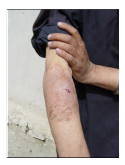
Figure 9: An abscess caused by injection

Five of the 38 drug users who still used pharmaceuticals said they had 'no problems' with taking these drugs, although 2 qualified their answer, by saying, "I don't have any problems because valum is available at pharmacies and I have the money to buy it", and "the only problem is that my children might find these drugs, swallow them and die". The people who had problems related to their use of pharmaceuticals were more likely to report problems they experienced if they didn't take the drug, such as becoming nervous and not being able to sleep, rather than those resulting from taking the drug. The most commonly reported health-related problem due to taking pharmaceuticals was reportedly 'dizziness', while some respondents said gastritis, nausea, and general forgetfulness. One woman claimed that "right now my menstrual periods are irregular", but this was more likely due to her consumption of opium than of pharmaceuticals.