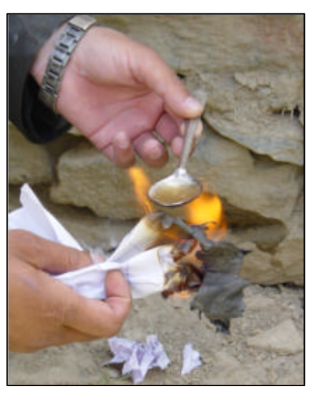
Figure 6 : 'Cooking' heroin prior to injection

In terms of methods of use, 40% reported that heroin was smoked, mainly by the method known as 'chasing the dragon' where heroin is placed on a piece of tin foil, a flame held underneath, and the resultant fumes drawn into the mouth through a thin tube. More disturbingly, a third reported that heroin was both smoked and injected. Two people claimed that users were moving from smoking to injecting, including the sharing of needles and syringes, because it was a more 'secret' and less socially obvious method of use, thus minimising the risk of being traced by the police through the smoke or smell of burning heroin. A few mentioned that heroin was also sniffed directly through the nose or taken by a method known as sekhi sang where a metal spike or thin knife blade is heated in a flame until very hot, then applied to a small quantity of the drug. The resultant fumes are then inhaled through a narrow tube. One person mentioned that he had seen a man with a head wound rub heroin into the wound until it was absorbed.