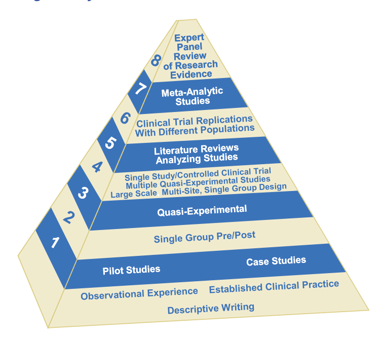
Figure 2: Pyramid of Evidence-Based Practices

The key question in determining whether a practice is evidence based is: What is the strength of evidence indicating that the practice leads to a specific clinical outcome? There is no gold standard for assessing strength of evidence, especially evidence derived from clinical experience. However, COCE has developed a pyramid to represent the level or strength of evidence derived from various research activities. As can be seen in Figure 2, evidence may be obtained from a range of studies including preliminary pilot investigations and/or case studies through rigorous clinical trials that employ experimental designs. Higher levels of research evidence derive from literature reviews that analyze studies selected for their scientific merit in a particular treatment area, clinical trial replications with different populations, and meta-analytic studies of a body of research literature. At the highest level of the pyramid are expert panel reviews of the research literature.