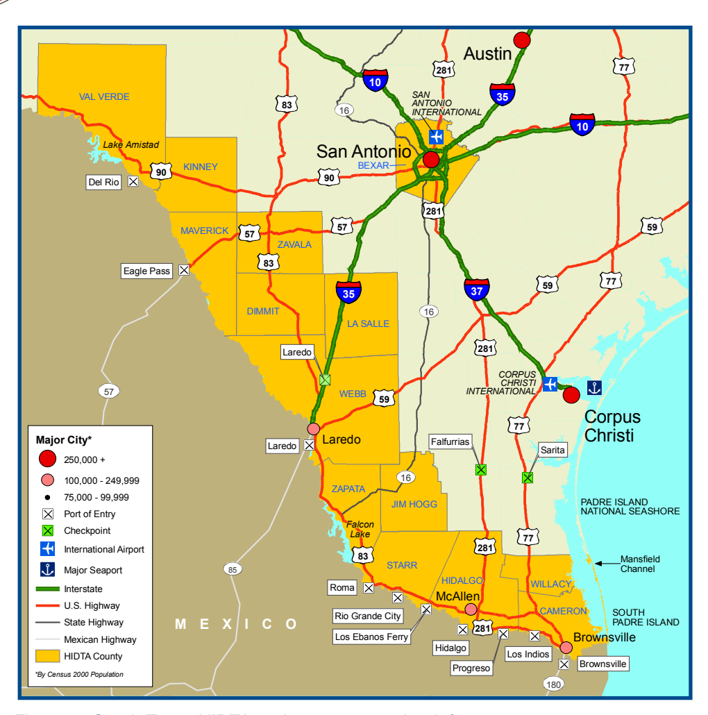
Figure 2. South Texas HIDTA region transportation infrastructure.

many Mexican DTOs are establishing cells in the city that specialize in drug transportation to other transportation and distribution centers in Texas and to drug markets in other regions of the United States. The highway network that supports San Antonio facilitates the movement of illicit drug shipments into and through the city. Most of the major roadways serving the area originate at the U.S.– Mexico border and connect with other roadways that serve drug markets throughout the country. (See Figure 2.) This transportation network also provides drug traffickers with various routes to transport bulk quantities of illicit drug proceeds to the South Texas border area and eventually into Mexico.