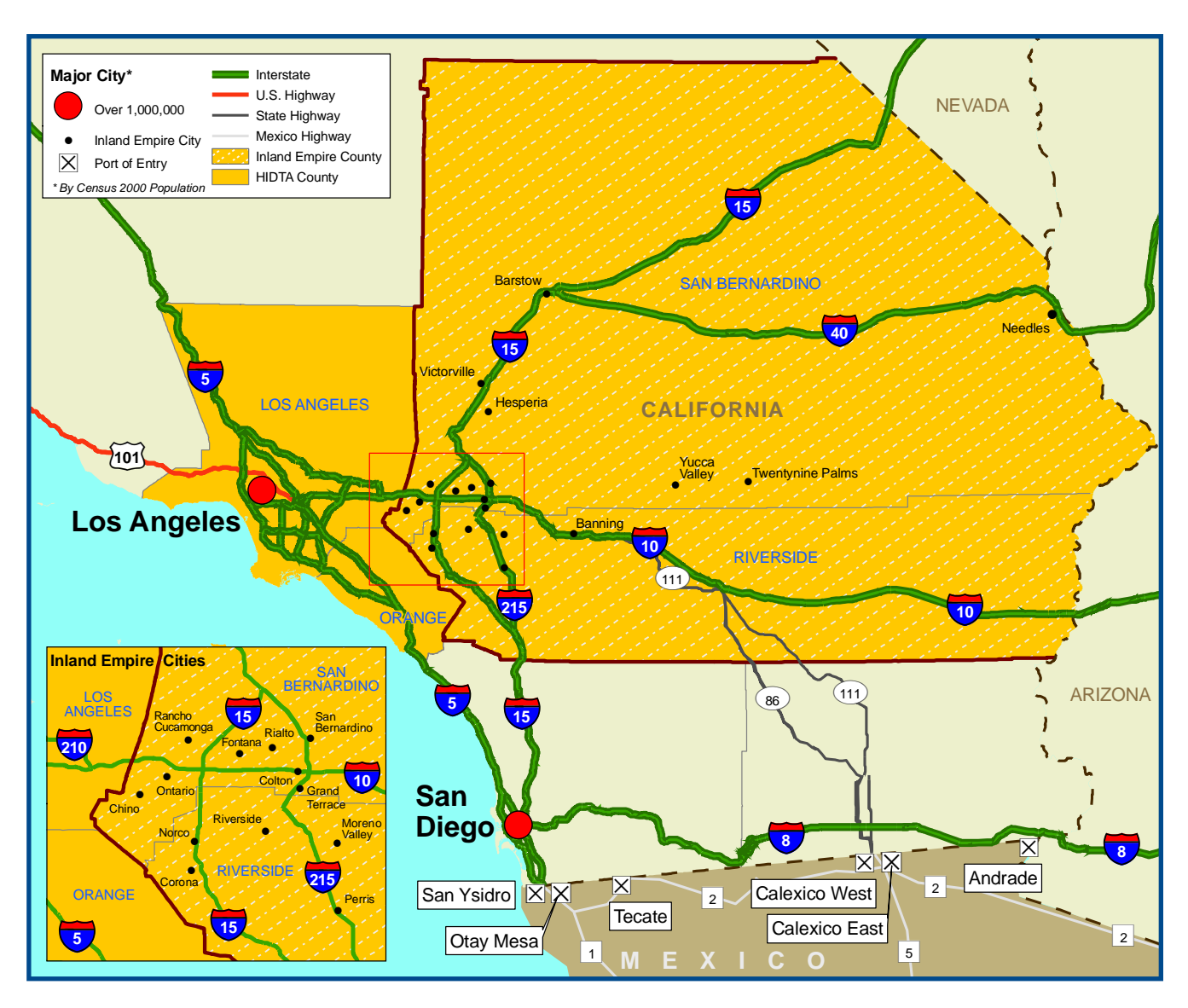
Figure 1. Los Angeles High Intensity Drug Trafficking Area.

This assessment provides a strategic overview of the illicit drug situation in the Los Angeles High Intensity Drug Trafficking Area (HIDTA) region, highlighting significant trends and law enforcement concerns related to the trafficking and abuse of illicit drugs. The report was prepared through detailed analysis of recent law enforcement reporting, information obtained through interviews with law enforcement and public health officials, and available statistical data. The report is designed to provide policymakers, resource planners, and law enforcement officials with a focused discussion of key drug issues and developments facing the Los Angeles HIDTA.