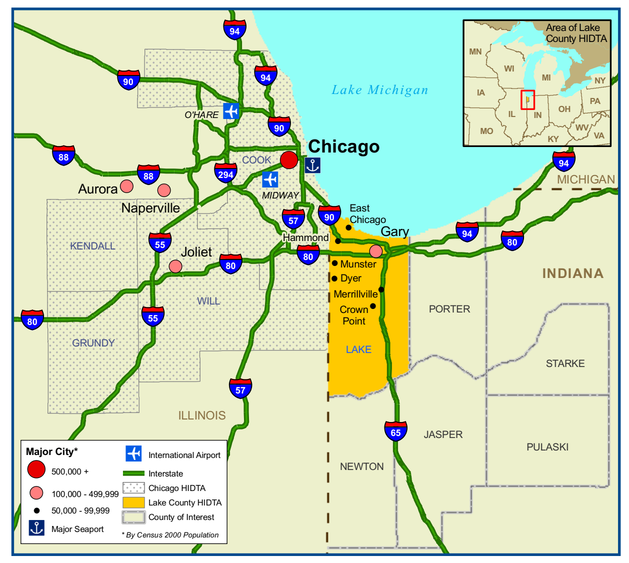
Figure 1. Lake County High Intensity Drug Trafficking Area.

This assessment provides a strategic overview of the illicit drug situation in the Lake County High Intensity Drug Trafficking Area (HIDTA), highlighting significant trends and law enforcement concerns related to the trafficking and abuse of illicit drugs. The report was prepared through detailed analysis of recent law enforcement reporting, information obtained through interviews with law enforcement and public health officials, and available statistical data. The report is designed to provide policymakers, resource planners, and law enforcement officials with a focused discussion of key drug issues and developments facing the Lake County HIDTA.