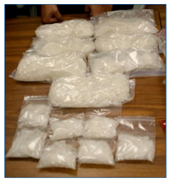
Figure 2. Mexican ice methamphetamine seized on the Big Island in 2007.

race/ethnicity and familial affiliation. Asian DTOs transport wholesale quantities of ice methamphetamine from sources in California and Asia, MDMA from sources in Canada and Asia, and high-potency marijuana from sources in Canada and the west coast of the United States.