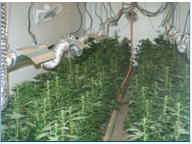
Hawaii County Police Departmeni

According to law enforcement officials, some cannabis cultivators exploit Hawaii's state medical marijuana laws to conduct illegal grow