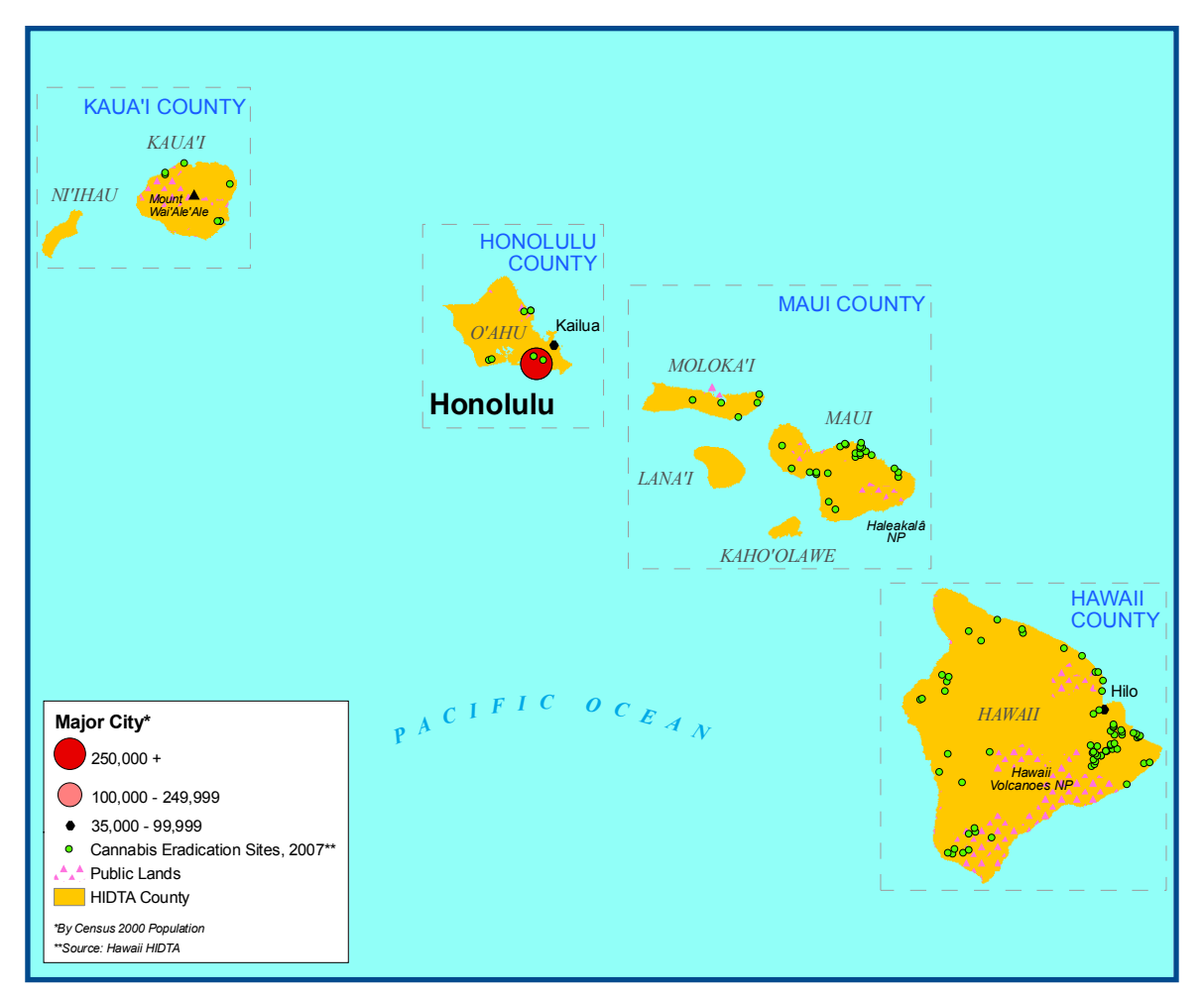
Figure 3. Cannabis plants eradicated, by HIDTA County, in 2007.