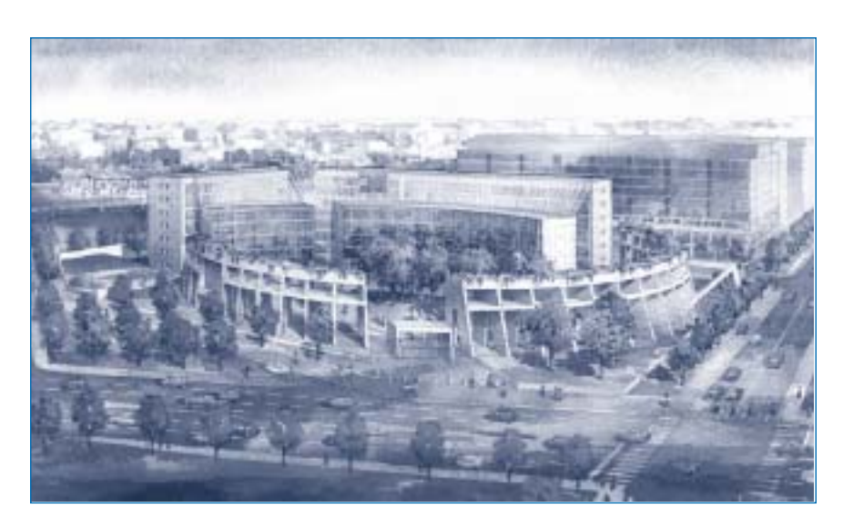
Artist renderings of the future Headquarters and Laboratory buildings.