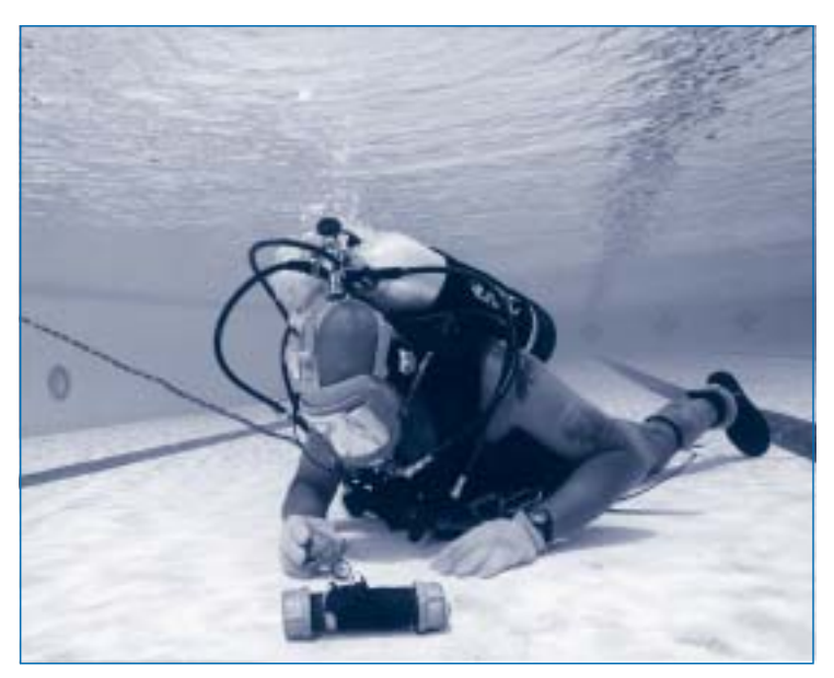
A Connecticut State Police officer practices underwater search and recovery patterns with his diving mask blacked-out with aluminum foil, as part of the Underwater Explosives Recovery Specialist Course in Edmond, Oklahoma, conducted by ATF and the Edmond Police Department.

The kits will be used to educate law enforcement and civilian groups in the recognition and danger of explosives.