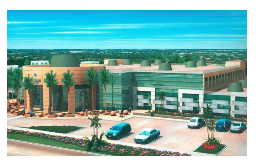
Artist Rendering of the Miami Field Office Please note that the artist's renderings may not reflect the final design

Each USCIS field office will provide the full range of immigration benefits, and contain an application support center and naturalization ceremony room. Incorporating the new USCIS model office concept, Liberty crown, is designed to symbolize a gateway into the United States.