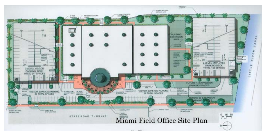
Department of Homeland Security

The building will include a two-story lobby and waiting rooms. The 43,500 square foot field office will be located on the first floor with the remaining 12,500 square feet for district leadership and administrative functions on the second floor.