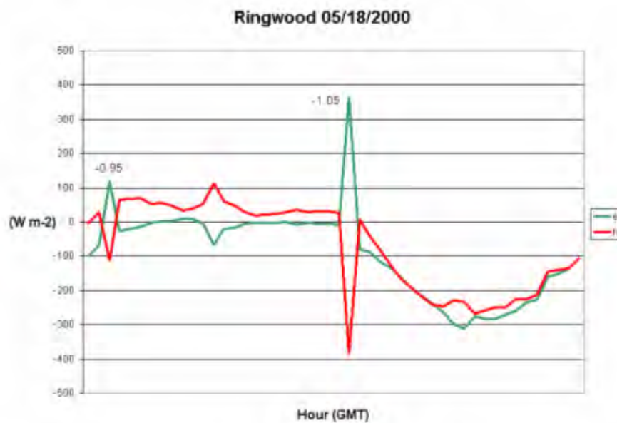
Figure 1. Plot showing sensible (h) and latent (e) heat fluxes showing a normal diurnal variation in heat fluxes. Spikes in the data occur at sunrise and sunset when the Bowen ratio is near -1.

The following plot of sensible (h) and latent (e) heat fluxes show a normal diurnal variation in heat fluxes, with latent heat flux being mostly negative during nighttime hours, as evaporation continues, and sensible heat flux being positive. During daylight hours, both h and e are negative, as energy is lost from the surface. The plot also shows the spikes in the data that can occur at sunrise and sunset when the Bowen ratio is near -1 (see the Bowen ratios annotated on the plot, near the data spikes).