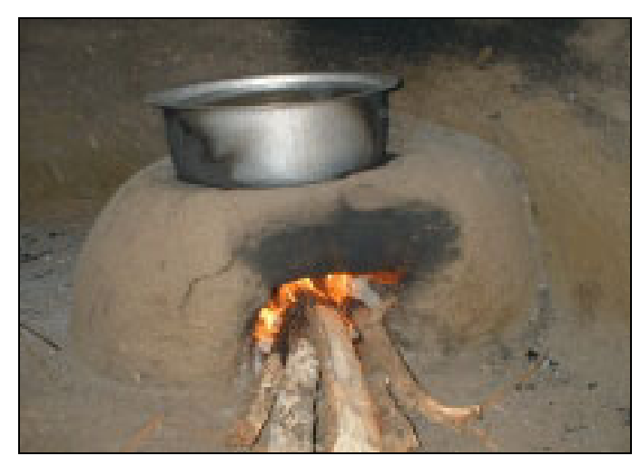
Figure 4: Traditional Luo mud-stove in Northern Uganda IDP camp