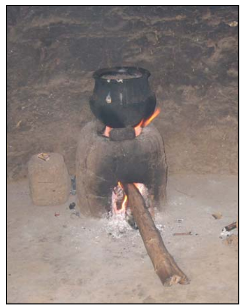
Figure 10: 6-brick stove plastered and installed in an IDP kitchen