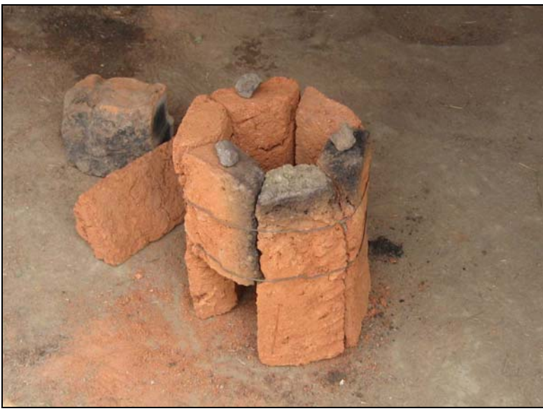
Figure 9: 6-brick stove assembled and awaiting collection

addition, the protective mud/clay covering (the "elbow") that attaches to the stove body and encloses the fuelwood had also been discarded. Pots rest on three small stones placed at the top of the stove to allow for improved air circulation.