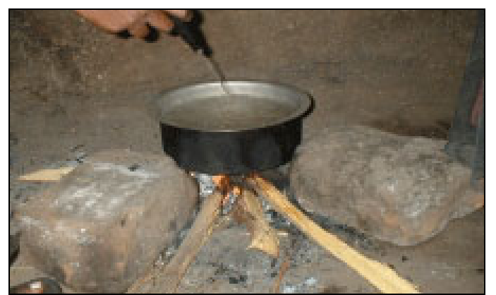
Figure 3: 3-stone fire

The dominant traditional cooking system in developing countries is known as the "3-stone fire". This is one of the simplest forms of cooking technology and is highly adaptable, as it can use many types of fuel (firewood, crop residues, dung, leaves) and any type or size of cooking pot (metal or clay, flat- or round-bottomed). The 3-stone fire consists of a cooking pot resting upon three stones or bricks which surround an open flame. It is free to build, simple to use and can serve various non-cooking functions (such as provide a social gathering point). However, depending upon the cook's skill, the 3-stone fire may require a lot of fuel, generate a lot of smoke, and present considerable safety risks from fires or burns. In IDP situations, where natural resources (such as wood) may be scarce, respiratory illness common and living quarters cramped and highly flammable, these are serious concerns.