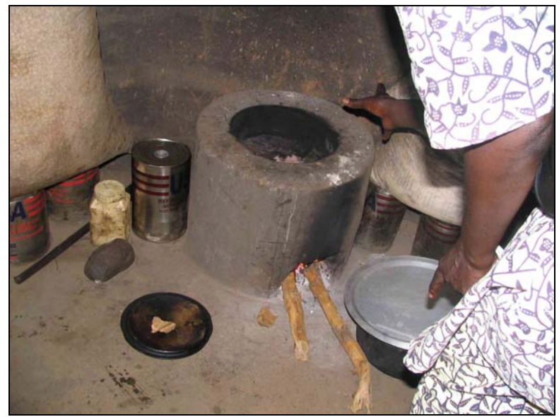
Figure 8: Molded 1-pot mud stove, promoted by NGO C in Gulu and Kitgum

In addition to its one-pot mud stove, NGO C promotes a two-pot stove referred to as a "Rocket Lorena," also designed by GTZ's Energy Advisory Project. This stove was developed due to reservations about the suitability and efficiency of the original Lorena, and incorporates rocket principles into the basic Lorena shape. Camp residents are free to select between the 1-pot molded stove and the 2-pot Rocket Lorena; at the time of the evaluation, 262 one-pot stoves had been disseminated, compared to only 6 two-pot stoves. This disproportionate response likely reflects user preference for smaller stoves that take up less room in cramped huts.