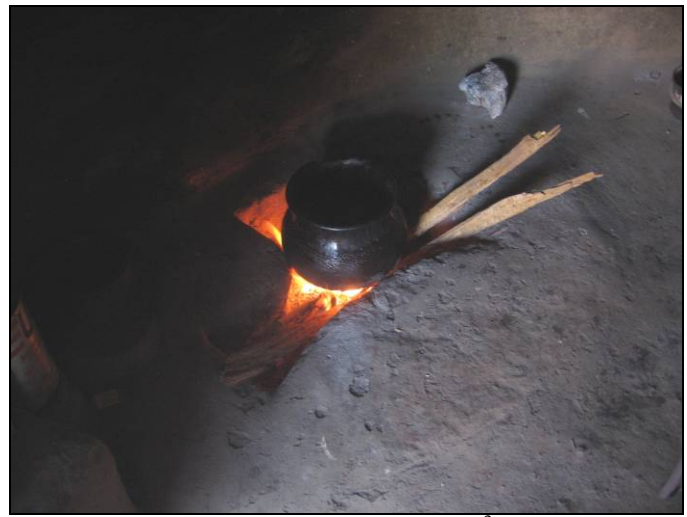
Figure 5: Trench fire, also known as the "Bylaw" stove<sup>3</sup>, in Northern Uganda IDP camp

Charcoal use is slowly penetrating the IDP camps. Unlike firewood, charcoal cannot burn directly on the ground and needs to be elevated by a grate on which charcoal lumps burn and glow. Often these stoves are made by the owner taking a traditional firewood stove and adding his or her own metal grate. In Northern Uganda, a bicycle sprocket ( Nang'a ) frequently serves as the grate, inserted into a traditional mud stove to convert it to charcoal use (see Figure 6).