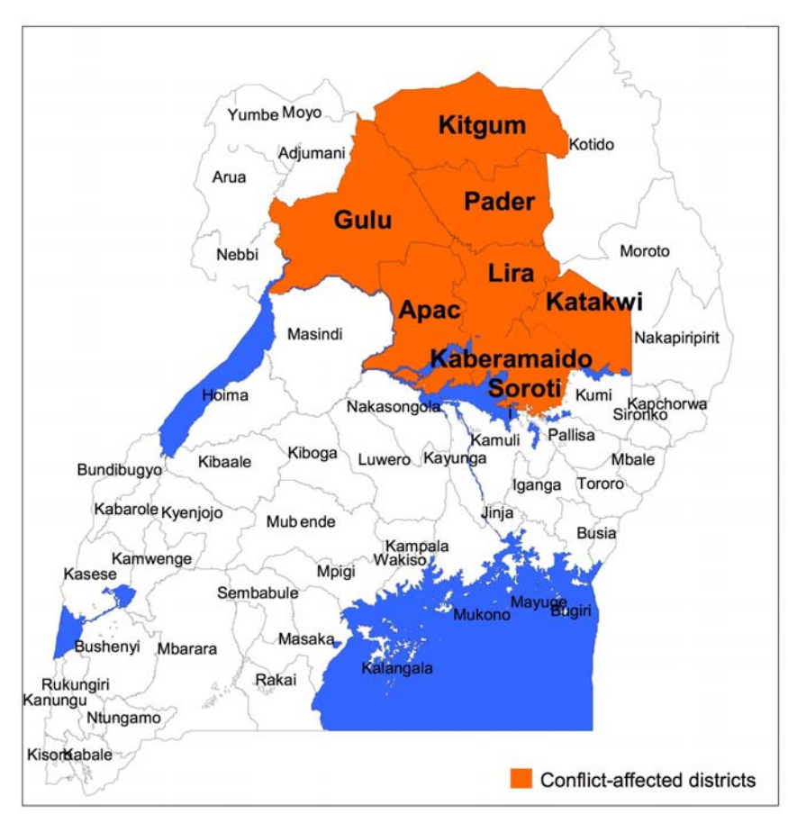
Figure 1: Conflict-affected districts, Northern Uganda

Over the past 20 years, Northern Uganda has suffered from a series of conflicts between the government and various rebel movements, the most prominent and long-running of which has been with the Lord's Resistance Army (LRA). The LRA began an insurgency in Acholi-land in 1987 and this spread to Lango and Teso in 2003<sup>1</sup>.