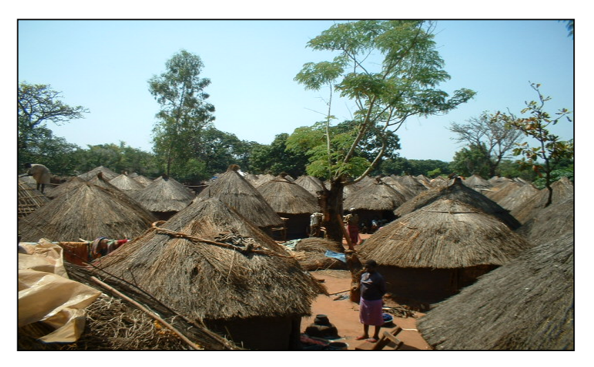
Figure 2: Typical camp scene, Kitgum District

Huts in the camps are positioned very close together with no physical divisions or defined household plots. This increases the risk of fire spreading rapidly and the burned remains of huts can be observed in some camps. Depending on a household's size and economic status, one hut may serve as both a kitchen and sleeping shelter, or there may be a separate hut used specifically for cooking.