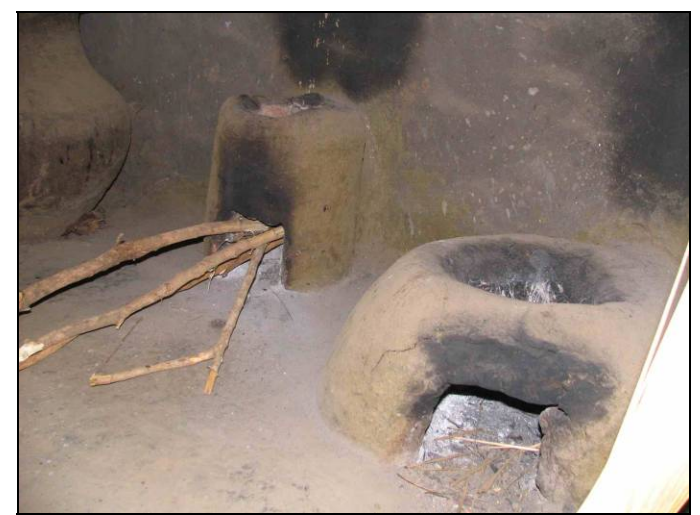
Figure 6: Nang'a charcoal stove (at right)