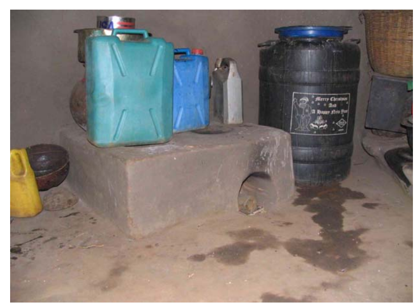
Figure 11: Lorena stove being used for storage

The one feature of the Lorena that some users seem to appreciate is the second pot hole, on which they can pre-heat water for cooking or other purposes under certain conditions. But this feature is also allowed for in traditional cooking systems simply by placing one pot on top of another or at the side of the fire, and is not an attribute unique to the Lorena. Although Lorena stoves have a second and sometimes a third hole, these will be useful only if the first hole is completely covered or closed off by the pan, which did not seem to be the norm in the camps visited for the evaluation.