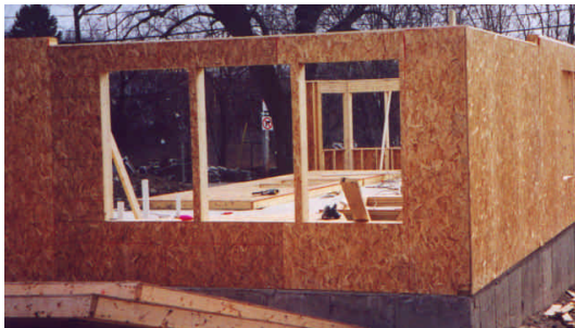
The building frames were assembled off-site in a warehouse, where unused construction materials were recycled, and weather did not affect the construction schedule. As a result, waste and delays were minimal.

The environmental benefits of ENERGY STAR labeled fixtures are also significant. By using less electricity than conventional lighting, they will keep as much carbon emissions out of the atmosphere as 1,414 cars generate every year.