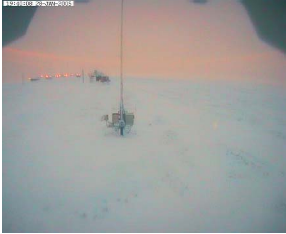
Figure 3. Image from Atqasuk cam. In the center is the Atqasuk 5-meter tip tower, on which meteorological instruments are located as well as downward-looking radiometers. Behind the tower, on the horizon, is the Atqasuk instrument shelter, and Atqasuk village lights to the left of it. The image may be used to estimate snow cover and general weather conditions. Only current images are available.