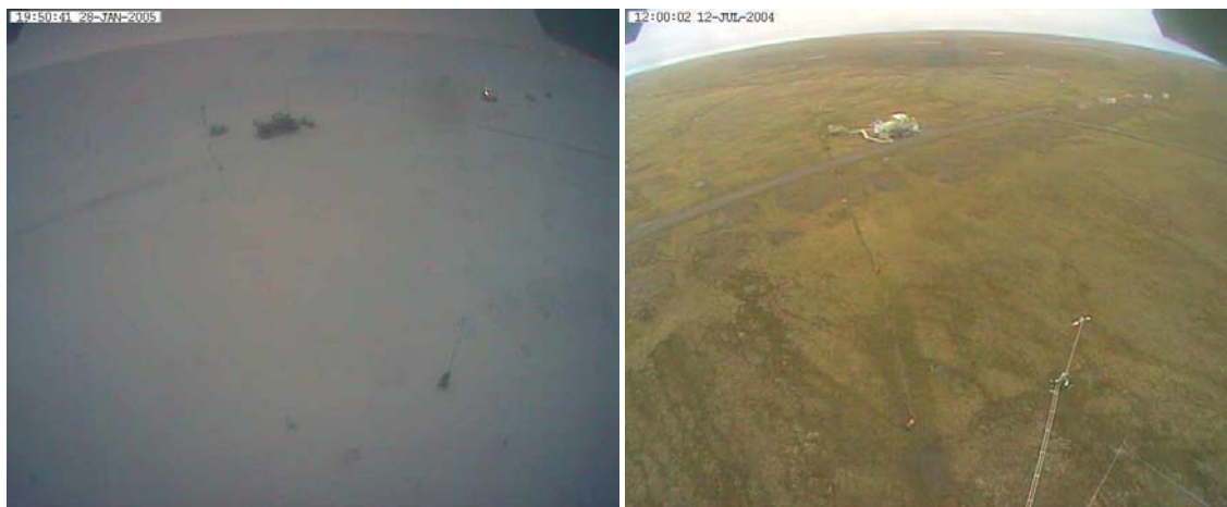
Figure 2. Winter (Jan 28, 2005) and summer (July 12, 2004) images from the tower camera located at the top of the 40-meter meteorological tower in Barrow. Near the upper center of the image, the Barrow instrument site is visible next to the gravel road. Near the bottom of the summer image, there are cables visible that are running along the ground to a 5-meter tip tower, on which the downward-looking radiometer instruments are located. In the winter image only the base of the tip tower is visible, but not the cables. These images can be used to estimate ground snow cover, as well as the general weather. The images from this camera are available from the Atmospheric Radiation Measurement (ARM) Program's data archive in addition to the current view obtainable from the web.