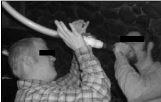
Drinking games and traditions may encourage heavy drinking.