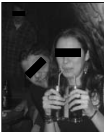
Excessive drinking is common at special events such as graduation, pre- or post-semester parties, and spring break.