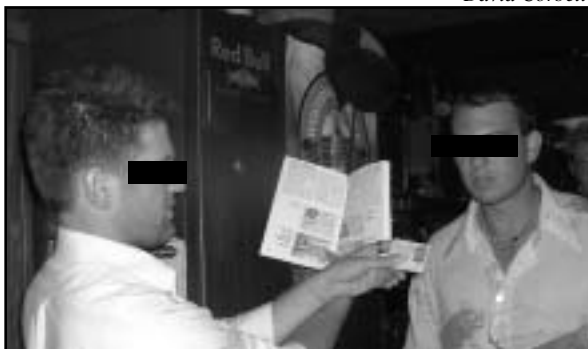
ID guides can help doormen to identify documents that have been falsified.