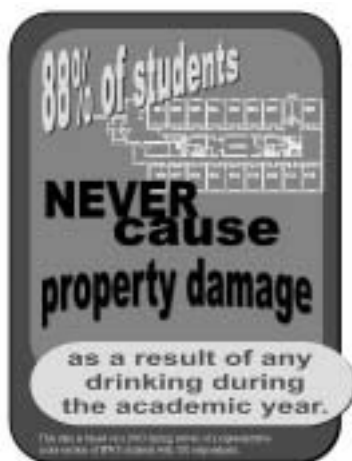
Posters and flyers raise awareness of the second-hand effects of drinking.

7. Raising underage drinkers' awareness of their behavior's impact on other people. Informing underage drinkers that their drinking adversely affects their peers, and that their peers are no longer willing to tolerate it, can encourage young people to reduce their alcohol use. 49