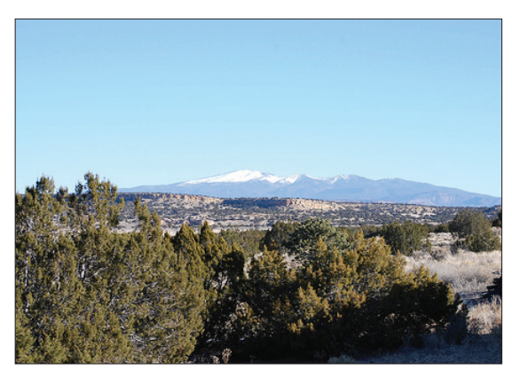
Mount Taylor, Cibola National Forest

Consulting parties to date include the New Mexico State Historic Preservation Office (SHPO), Navajo Nation, Hopi Tribe, Pueblo of Zuni, Pueblo of Laguna, Pueblo of Acoma, Urex Energy Corporation (applicant), and the Advisory Council on Historic Preservation (ACHP). The FS plans to invite and recognize additional parties including local governments and land grant communities, representatives of the uranium mining industry, and interested environmental and historic preservation organizations. At present no agreements are in place; however, the outcome of Section 106 consultation to resolve adverse effects, which is at its