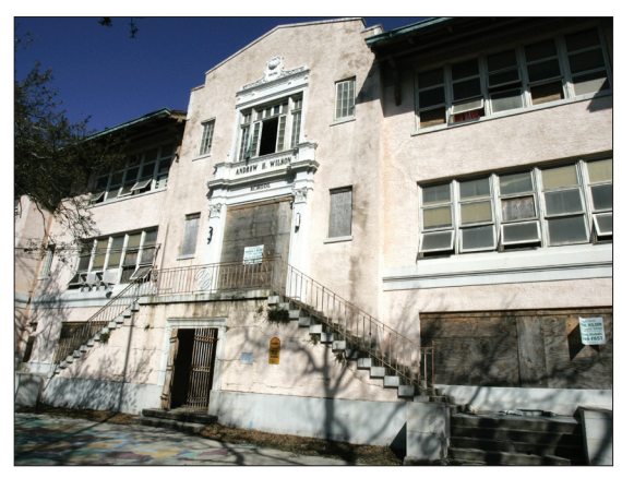
The Andrew H. Wilson school will be repaired and rehabilitated by the Recovery School District in New Orleans through funding provided by the Federal Emergency Management Agency.

The school annex and the Gatekeeper's Lodge, both dating to 1930, are contributing resources in the Broadmoor Historic District, and will be demolished to construct the new addition compatible with both the Wilson School and surrounding Broadmoor Historic District. FEMA and the architect for RSD have worked with the Louisiana State Historic Preservation Office (SHPO) to design that addition. It also will be constructed so as to receive Leadership in Energy Development and Design (LEED) certification. The