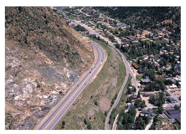
Interstate 70 at the Georgetown-Silver Plume National Historic Landmark

Throughout consultation, local governments and historic preservation organizations in the historic mining towns opposed the most likely alternative, adding traffic lanes to I-70, because it would further contribute to increased traffic and noise pollution. These organizations strongly supported a multi-modal solution to the project, whose purpose is to reduce traffic congestion and increase capacity between Denver and popular recreation areas (including ski areas) along the corridor. In October 2007, CDOT invited 27 stakeholders to work with an independent facilitator to find a preferred alternative that best meets the needs of local governments; highway users; transit, environmental, business, and recreation interests; as well as state and federal agencies. This "Collaborative Effort" stakeholders group, which includes a representative of the historic preservation community, is close to reaching an agreement on a vision and specific recommendations for Tier 1: a multi-modal solution that includes noninfrastructure components, a commitment to evaluation and implementation of an Advanced Guideway System, and highway improvements. The Section 106 PA establishes a process for consultation during Tier 2