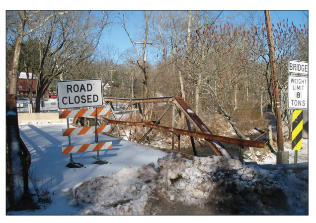
The Geigel Hill Road Bridge will be replaced after Section 106 consultations.

Other consulting parties included the township, Tinicum Township Planning Commission, Institute of Community Preservation, Tinicum Creek Watershed Association, Lower Delaware Wild and Scenic