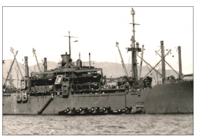
The USS Gage as it appeared in Cury, Japan, in October 1945

Consulting parties include the Virginia State Historic