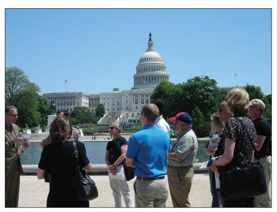
Consulting parties gather at the west edge of the Capitol Reflecting Pool while considering the National Park Service's National Mall Plan.

The NPS intends the National Mall Plan to provide detailed guidance about mundane issues as well as establish a conceptual vision for the future. The NPS has