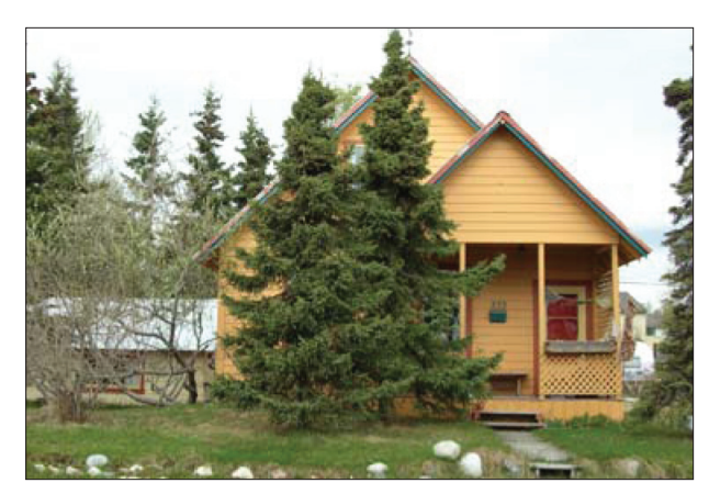
Alaska Engineering Commission Cottage on Government Hill

The Alaska State Historic Preservation Office (SHPO) feels FHWA has not adequately considered the undertaking's potential for indirect effects,