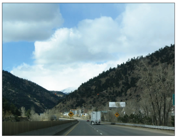
View of Interstate 70 approaching Idaho Springs. The Section 106 case regarding development of the transportation corridor associated with the interstate west of Denver is now closed.

The existing highway cuts through several historic mountain communities. They include the Georgetown-