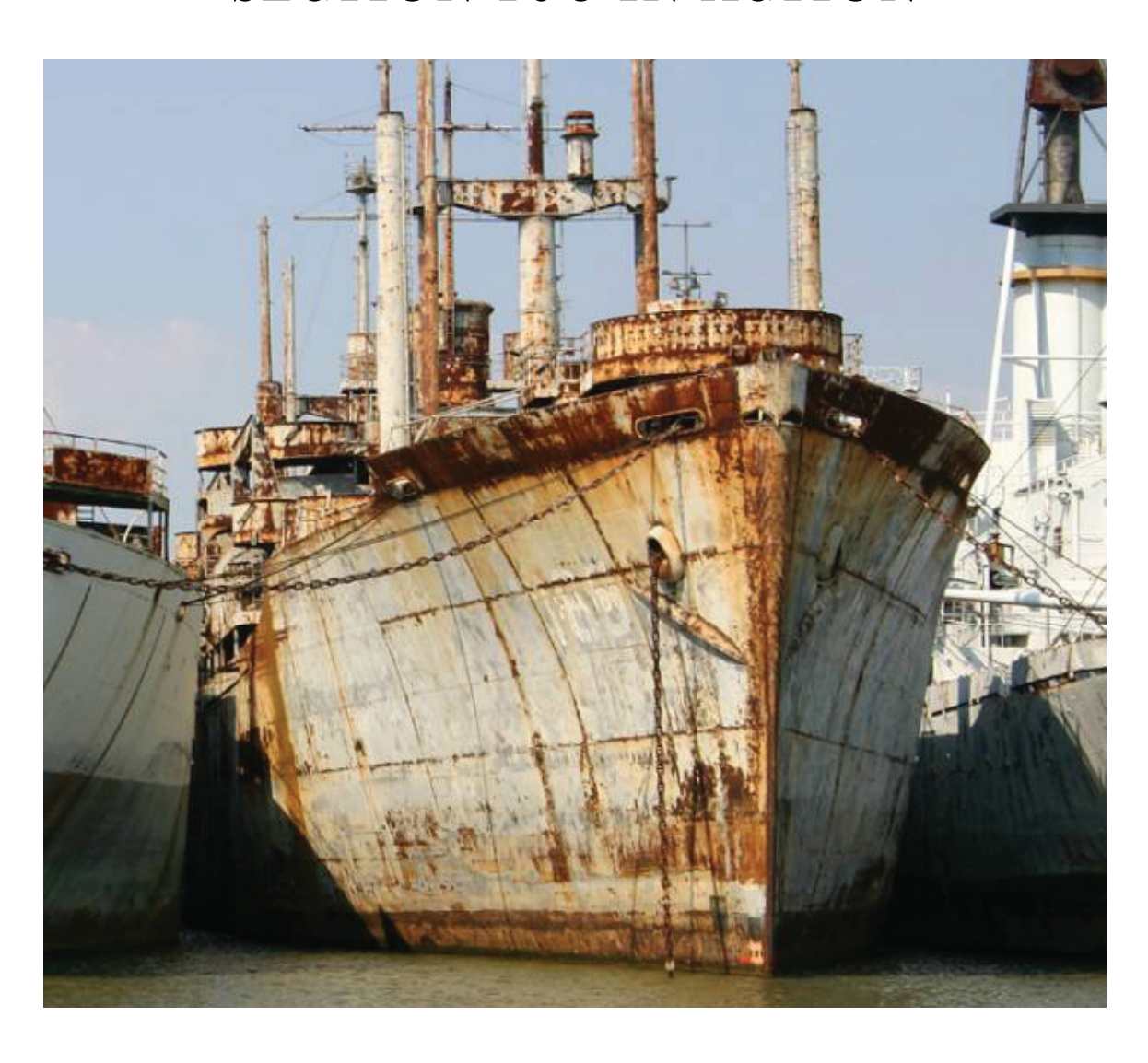
ADVISORY COUNCIL ON HISTORIC PRESERVATION SUMMER 2008