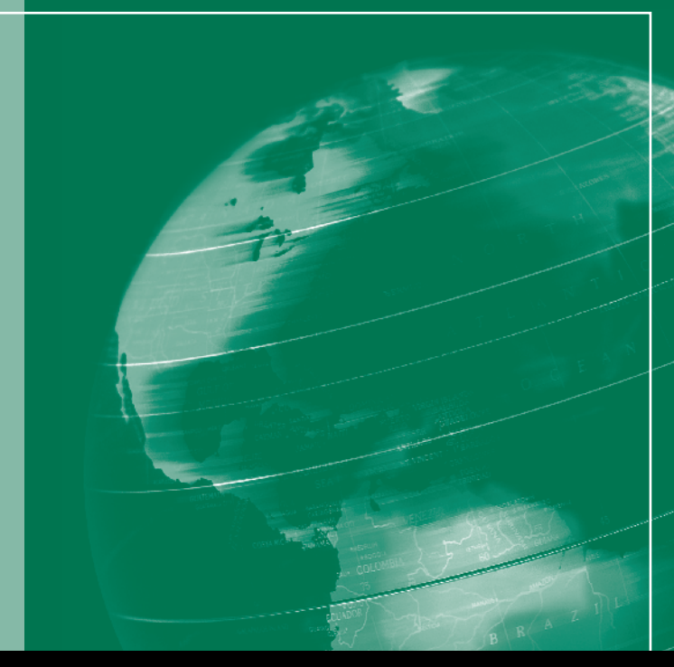
U.S. TRADE AND DEVELOPMENT AGENCY