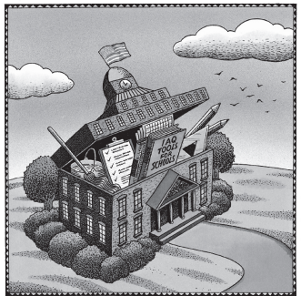
Tools for Schools

This commonsense guidance is designed to help you prevent and solve the majority of indoor air problems with minimal cost and involvement.