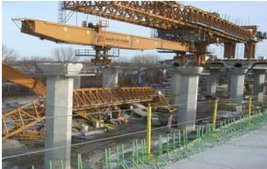
Figure 4: View of the Launching Gantries after the Accident