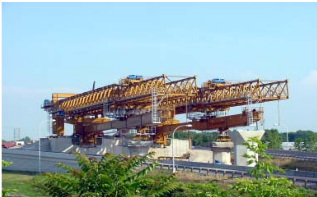
Figure 2: Two Launching Gantries Side-by-side.

The launching gantry is used to place concrete bridge and pier segments for elevated roadways and bridges by spanning the distance between a finished road segment and the next roadway pier or column. While spanning this distance, the launching gantry picks up each bridge segment and suspends the segments from beneath the overhead truss moving the segments into place. The segments are then epoxied together and post-tensioned into place. Following the successful placement of the roadway segments beneath the overhead truss, the entire launching gantry is then moved forward to the next span along its previously launched under-bridge. The under-bridge provides a temporary bridge over the span for the front leg of the launching gantry to travel and position the structure over the next span. (See Figure 3)