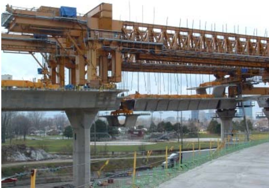
Figure 3: Launching Gantry with Suspended Segments.

For this particular design, the manufacturer required the use of four anchoring bars for each of the four rear legs (sixteen total anchoring bars) and two anchoring bars for each of the two telescoping front legs (four anchoring bars total). The anchoring bars in the rear were designed to be pre-stressed to 600 kilo-Newton's per bar (approximately 135,000 pounds of force per bar) to provide resistance to the longitudinal and transversal forces primarily during the launching of the under-bridge. The front leg anchors were to be pre-stressed to resist transversal forces, such as those created by wind.