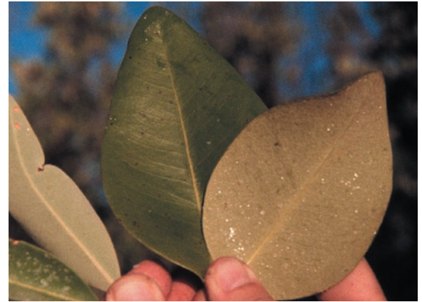
Figure 1.5 Close-up of mangrove leaf showing salt crystals (C.E. Proffitt; Gulf of Fonseca, Honduras).

Aerial roots- Roots that are formed in and exposed to air. In mangrove species (e.g., Rhizophora spp.), aerial roots develop into stilt roots (prop roots and drop roots) that anchor into the sediment, offering mechanical support and nutrient absorption.