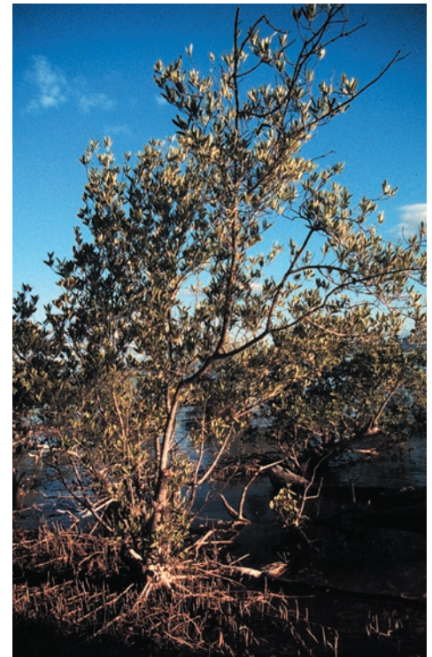
Figure 1.3c Avicennia. (C.E. Proffitt).

Propagule - Seedling growing out of a fruit; this process begins while the fruit is still attached to the tree. For some species of mangroves, propagules represent the normal, tidally dispersed means of reproduction.