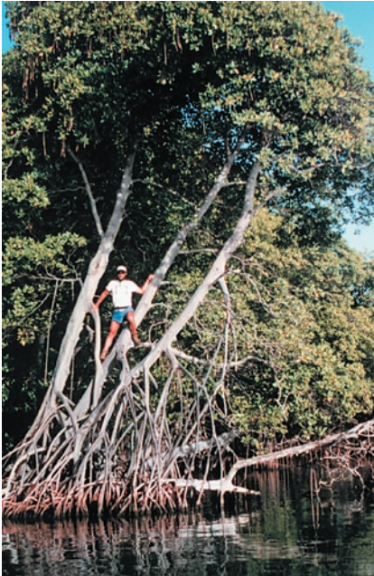
Figure 1.6 Rhizophora tree (with man in branches) showing prop roots (C.E. Proffitt).

Mangrove mortality from biological sources includes competition, disease, herbivory predation, and natural tree senescence. All developmental stages are affected, including propagules, seedlings, saplings, and trees. However, mangroves in early stages of development experience higher mortality rates and mortality is generally density-dependent. At the tree stage, smaller trees are at higher risk due to competition with larger trees for light and/or nutrients.