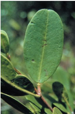
Figure 1.3a Conocarpus.