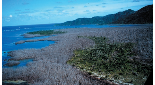
Figure 1.7 Aerial photo of mangrove forest showing hurricane damage in Guanaja, Honduras, taken 14 months after Hurricane Mitch.

Mangrove ecotourism is not yet a widely developed practice, but seems to be gaining popularity as a non-destructive alternative to other coastal economic activities. Mangroves are attractive to tourists mostly because of the fauna that inhabit these forests, especially birds and reptiles such as crocodiles.