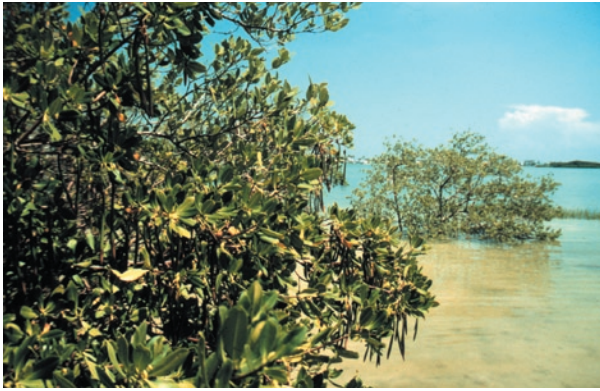
Figure 1.4 Rhizophora trees in Florida, with propagules (C. E. Proffitt).

Evapotranspiration - The transfer of water from the soil, through a plant, and to the atmosphere through the combined processes of evaporation and transpiration. Evaporation is a function of surface area, temperature, and wind. Transpiration is a process of water loss through leaf stomatal openings, and is related to gas exchange and water transport within a plant. When the stomates open, a large pressure differential in water vapor across the leaf surfaces causes the loss of water from the leaves.