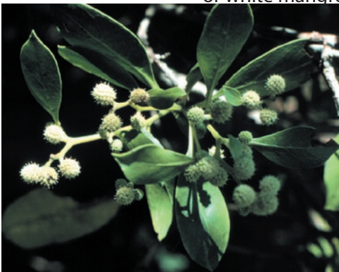
Figure 1.3b Laguncularia Avicennia (C.E. Proffitt).

Mangroves colonize protected areas along the coast such as deltas, estuaries, lagoons, and islands. Topographic and hydrological characteristics within each of these settings define a number of different mangrove ecotypes. Four of the most common ecotypes include fringe, riverine, basin, and scrub forests (Lugo and Snedaker 1974; Twilley 1998). A fringe forest borders protected shorelines, canals, and