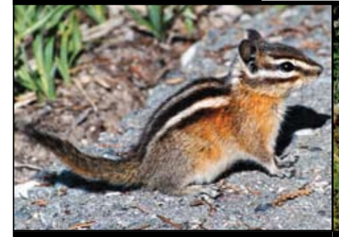
Townsend's chipmunk Tamias Townsendii