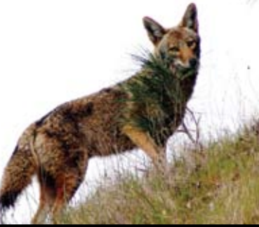
Coyote Canis latrans