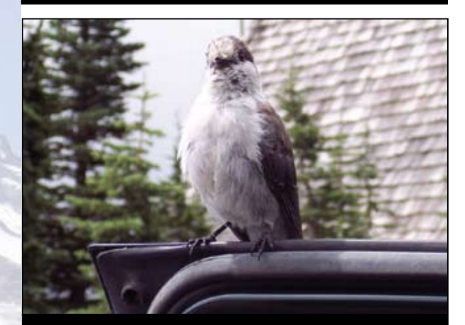
A gray jay aggressively seeking humans for food