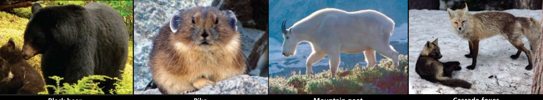
Black bear Ursus americanus

Visiting Mount Rainier can be a wonderful experience.