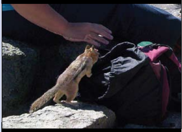
A squirrel robbing a pack may bite or pass disease