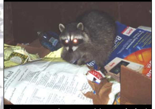
A raccoon scavenging unsecured dumpster for food