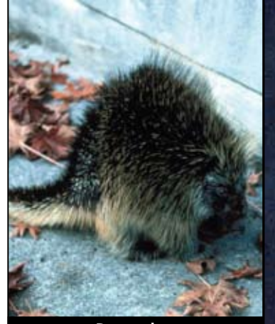
Porcupine Erethizon dorsatum